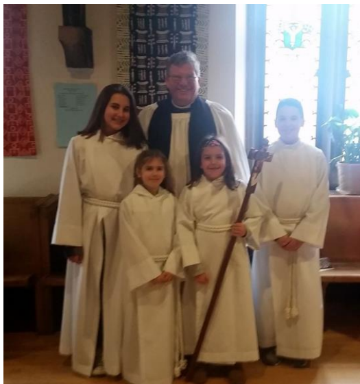
Four of our acolytes attended the Acolyte Festival in Trenton on February 11.