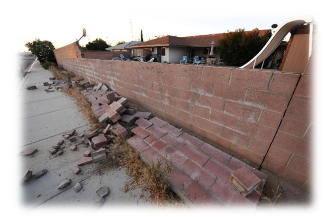
(Amateur radio antenna mast in background, top of photo near center)

ARES Responds to Early July Earthquakes and Aftershocks in Southern California