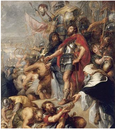
The Triumph of Judas Maccabeus (Rubens)