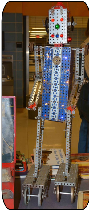
Robot Man (non member)