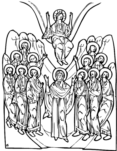
1 Apostles witness His Ascension

Out of 14, 1 was lost forever (Judas), 9 were martyrs who left their local surroundings and were foreign missionaries and church planters. 4 were local missionaries in Jerusalem/Judea.