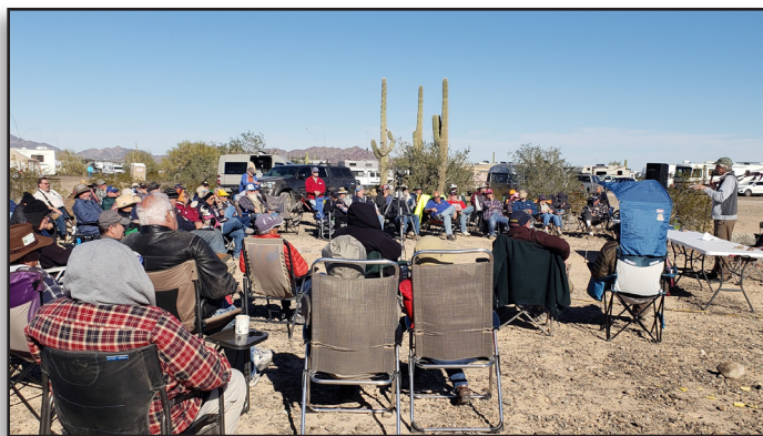
ARRL Southwestern Division Director brought attendees up to date on the recent ARRL board meeting.

On Thursday evening, the Sunlife and Venture Out clubs had a nice well attended potluck dinner and one of the members flew a drone over the gathering. https://www.youtube.com/watch?v=CoZBKDwuiUs .