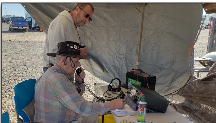
The Special Event Station, W7Q, was up and operating every day of the event. Anyone could come in and operate if they desired.

Quartzfest ran from January 20, 2019 through January 26, 2019. I left San Diego on the morning of the 20th and after a five hour drive (with a stop in Yuma) I arrived at the Road Runner camping area on Bureau of Land Management (BLM) land just outside Quartzsite. Camping there is free for up to 14 days, more than enough time to cover the event. I arrived in time to catch the tail end of the opening ceremonies ( Cover Photo ).