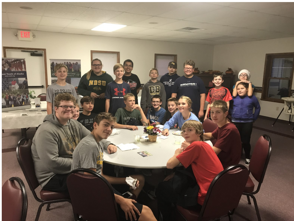
A group of the Hi-League kids are pictured above before the presentation by Covenant Youth of Alaska. There are between 20-30 high schoolers from Dawson Covenant Church and Calvary Baptist Church along with friends who regularly attend Wednesday night Hi-League activities.