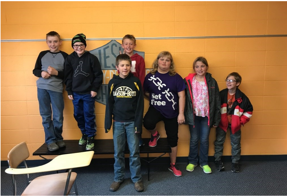
The K-6th grade kids are divided into 2 age groups for Release Time. Shown above are some of the kids from the upper elementary age group.