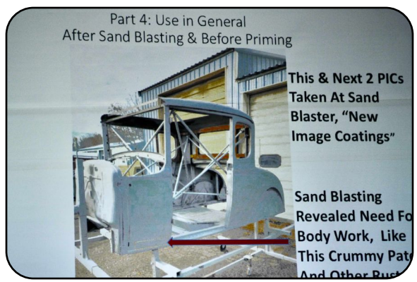
It is all in the details