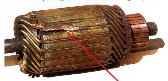
The armature, in this case, was also damaged from the extreme heat that builds up until you can find a way to break the circuit.

No sticking, no shorting, no fires, no damages to parts, no unwanted spinning, and it has never stuck again. (CY)