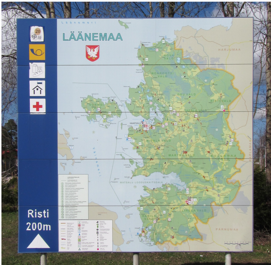
Roadside map in Risti, showing the region that we birded from our base in Haapsalu