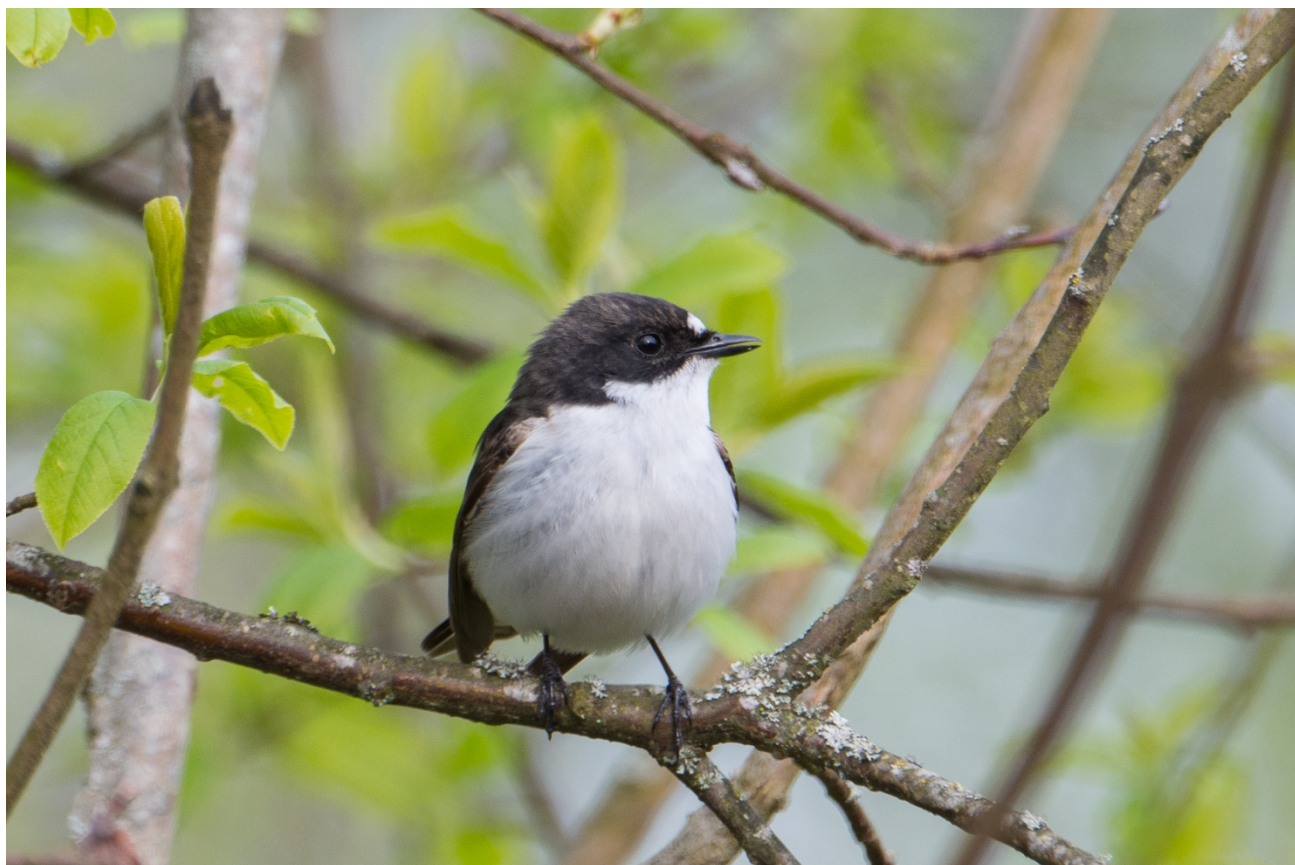
Pied Flycatcher [Haeska]