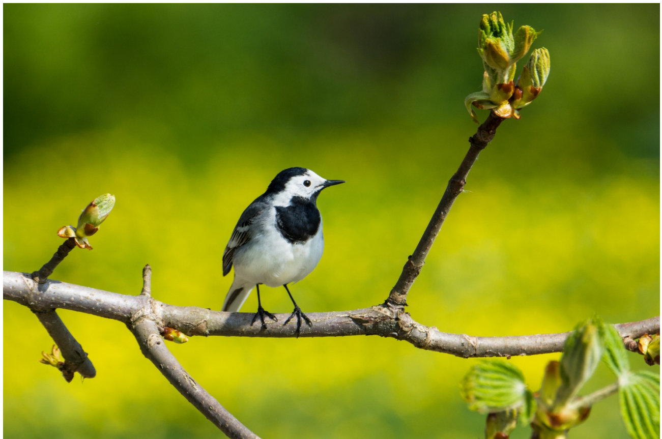
White Wagtail [Penijõe mõis manor house, near to Lihula]