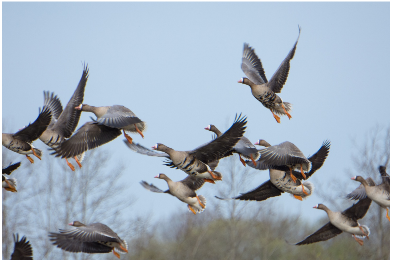
Greater White-fronted Geese [in fields near to Haeska]