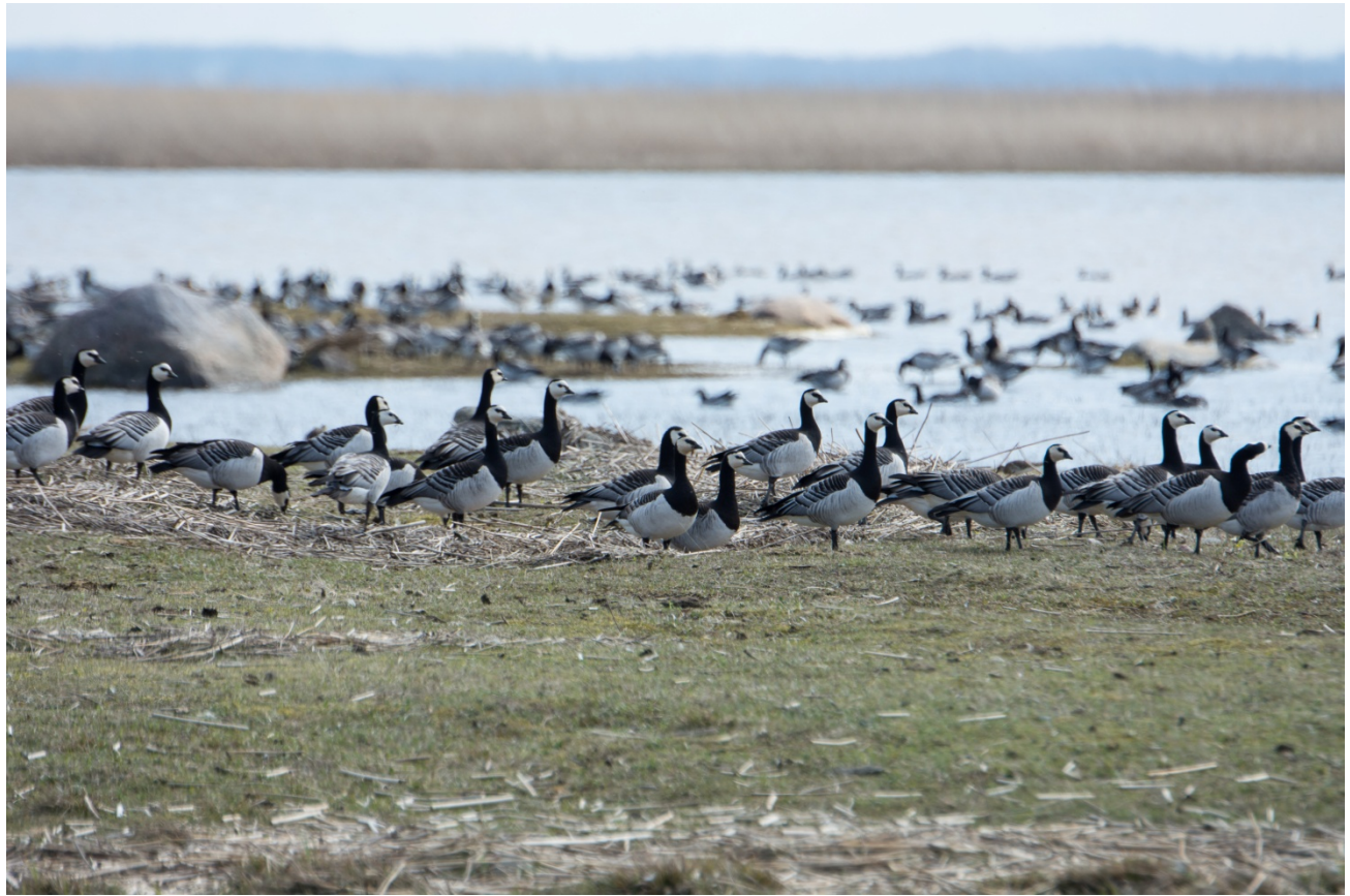
Barnacle Geese [near to the Haeska observation tower]