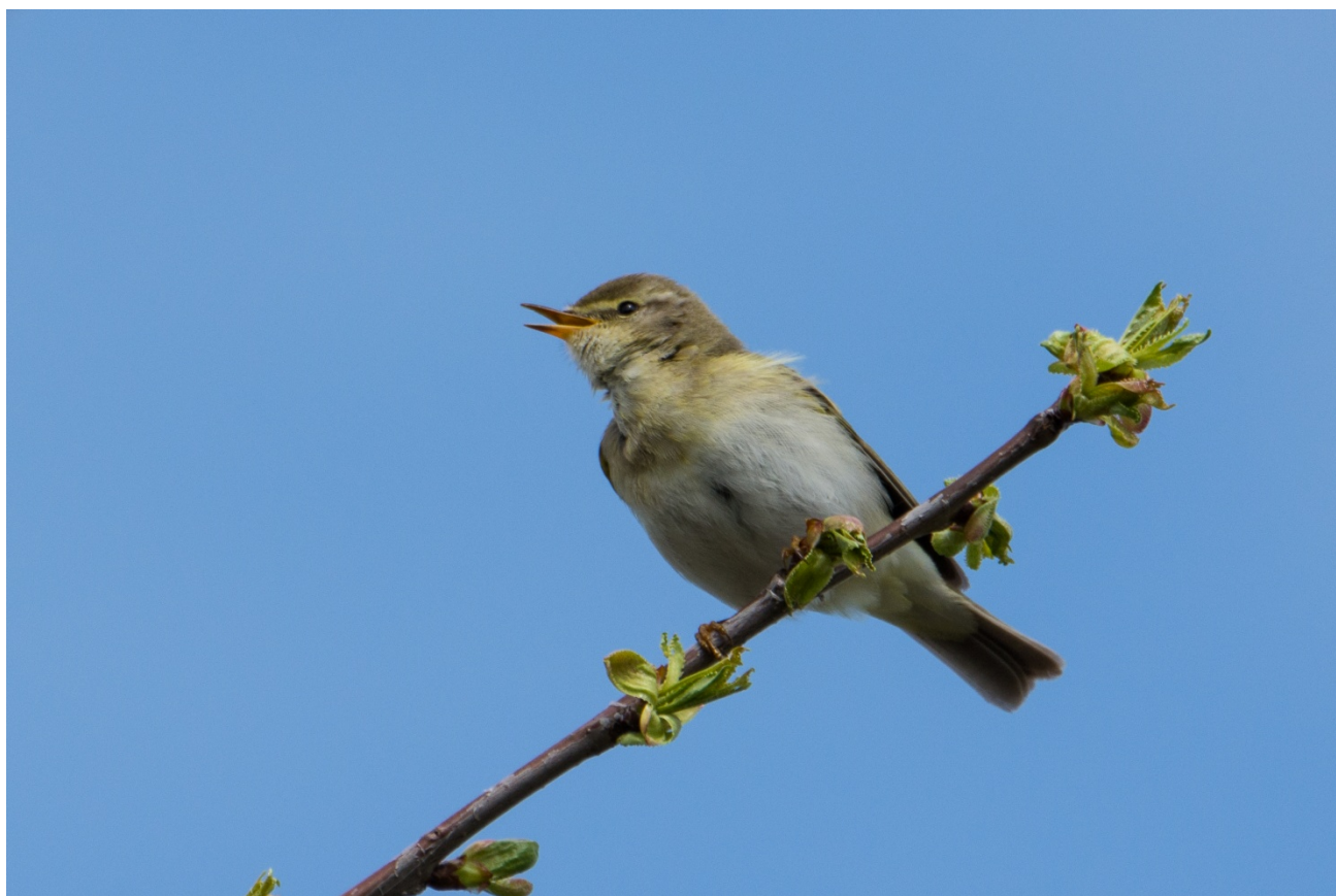
Willow Warbler singing away [near to Haeska observation tower]