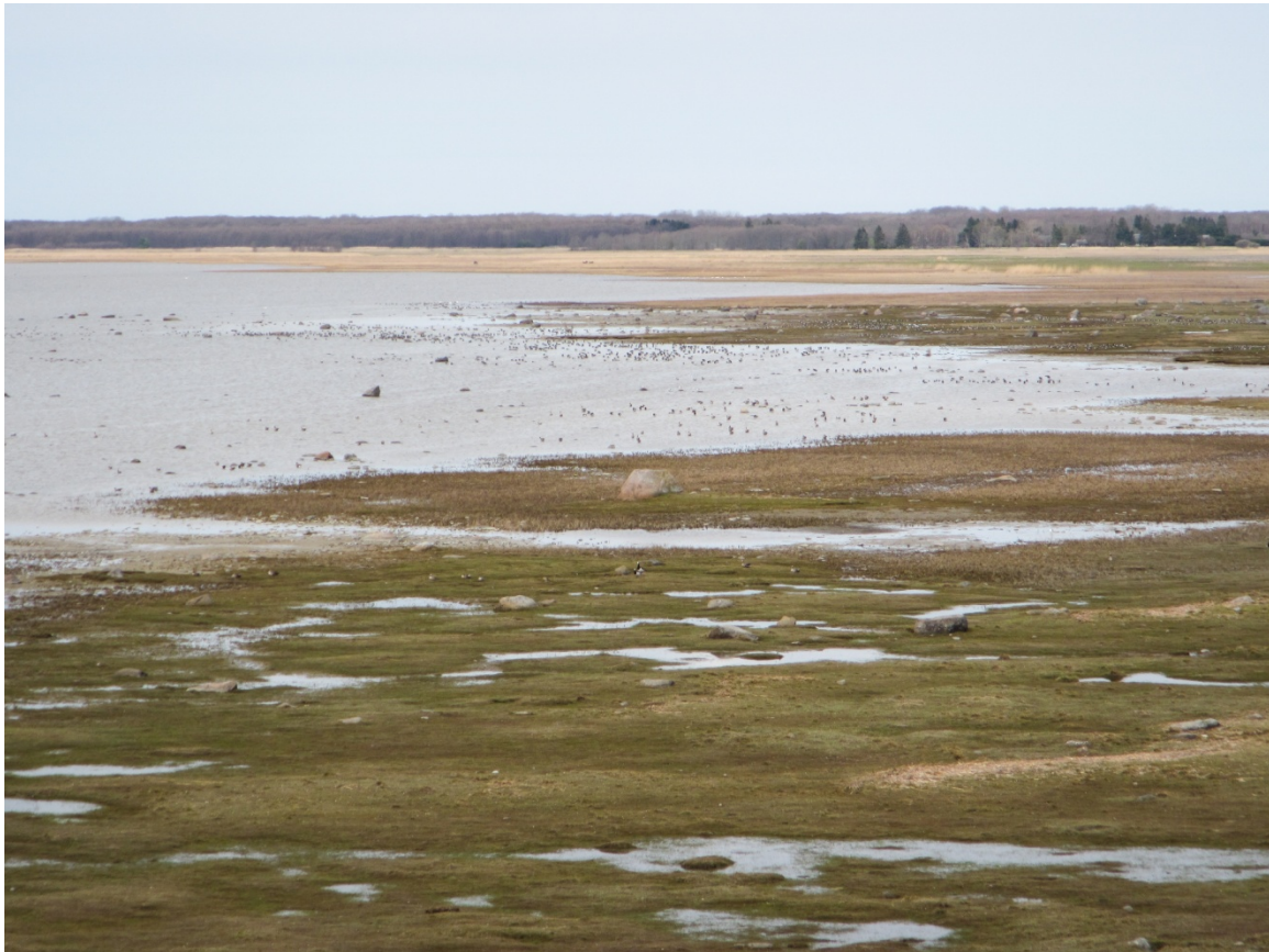
View over the coastline and thousands of ducks, geese and shorebirds from the observation tower at Haeska