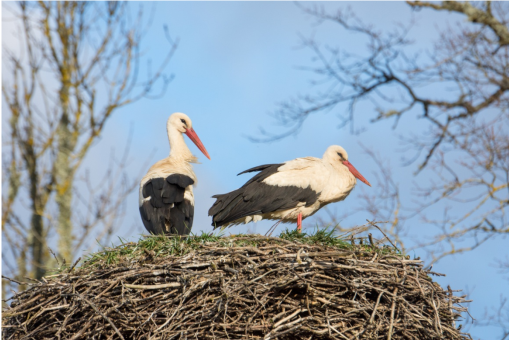
White Storks [Vanamõisa sild manor house]