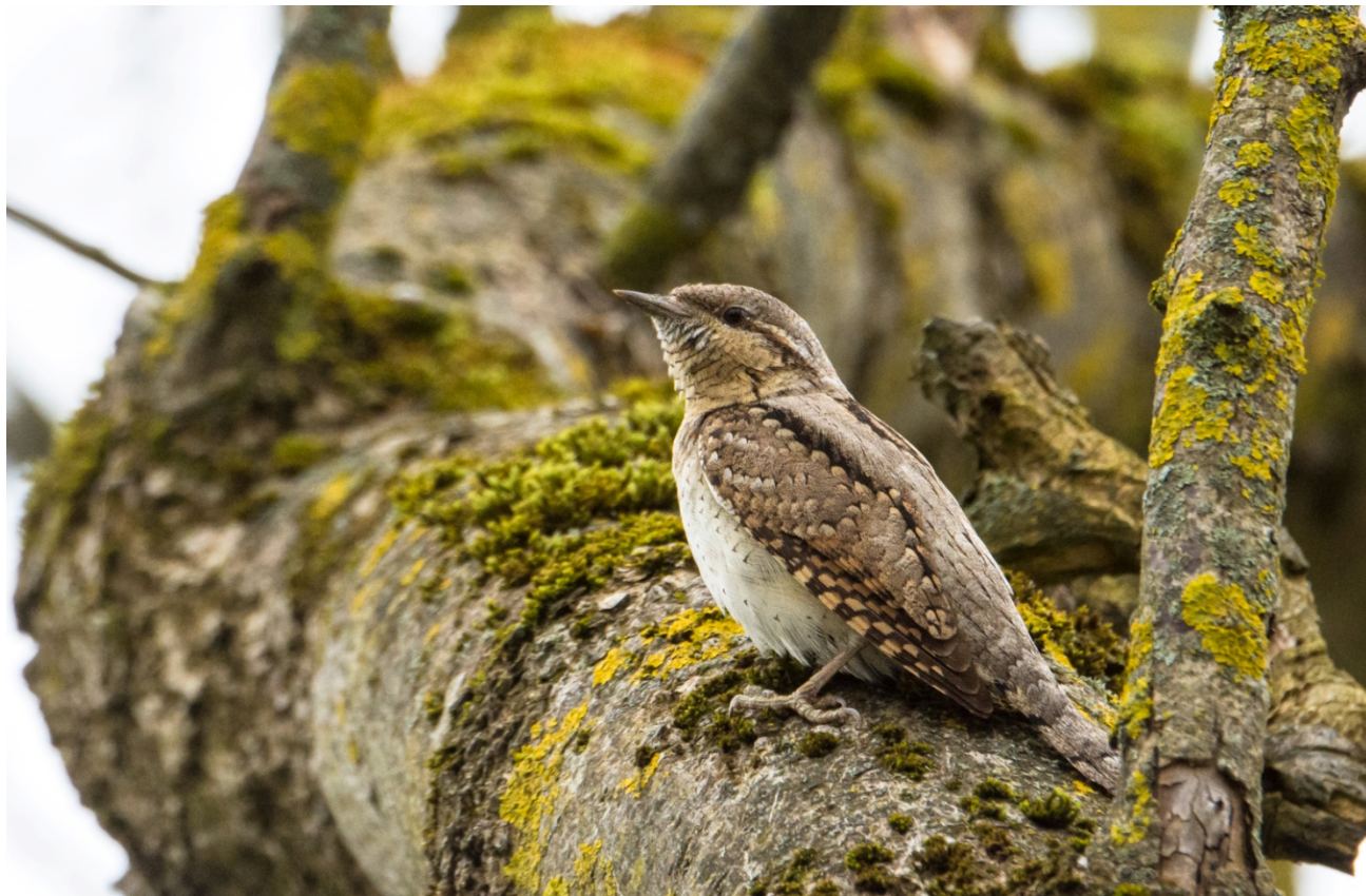
Eurasian Wryneck [Haeska]