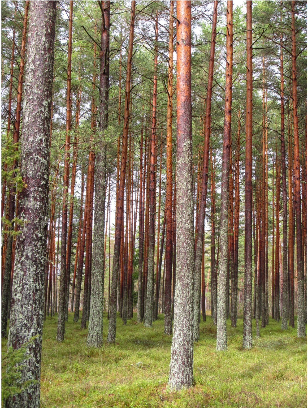
Pine forest in the vicinity of Läänemaa Suursoo, between Haapsalu and Nõva