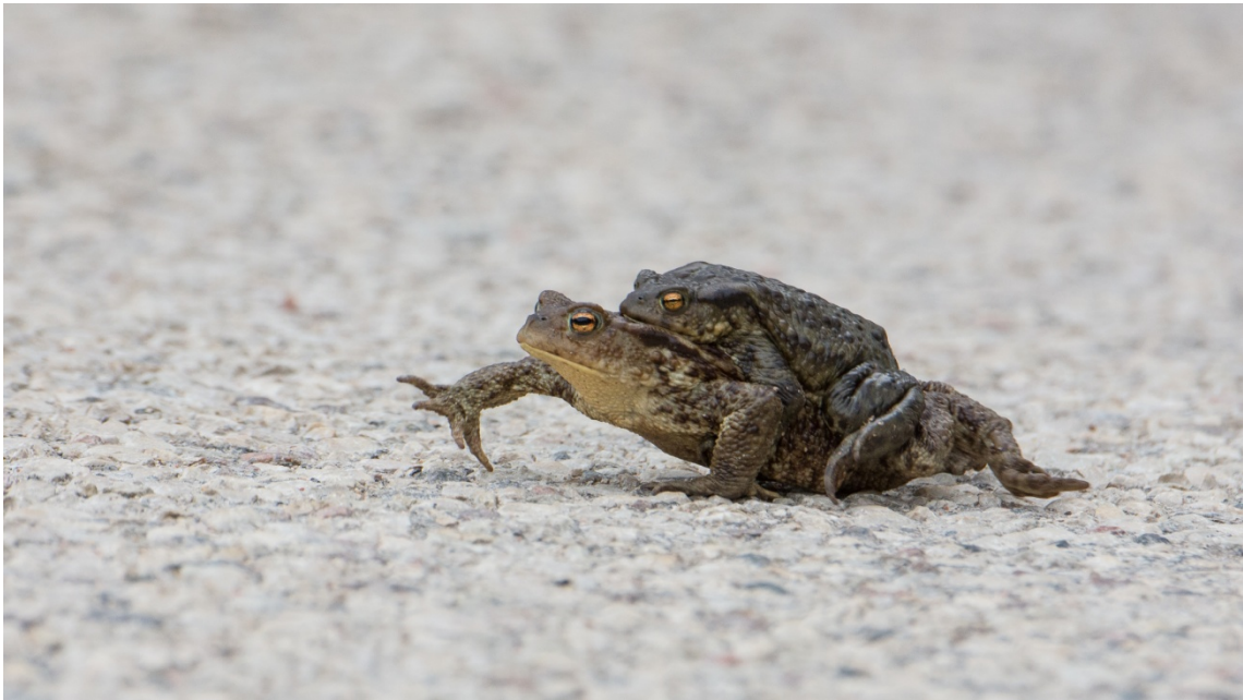
European Toads [near to Haapsalu]