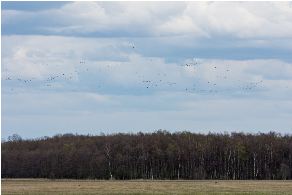
Typical inland scenery: Fields, forest and a sky full of migrating geese! [Haeska]