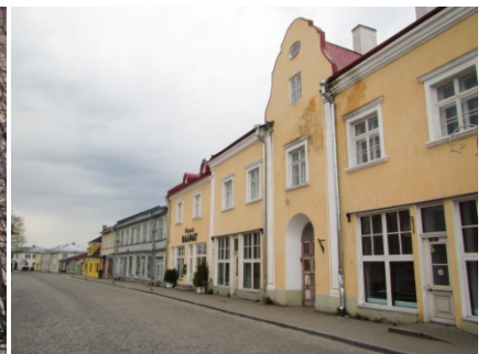
Scenes around Haapsalu's historical city centre and the adjacent coastal observation tower