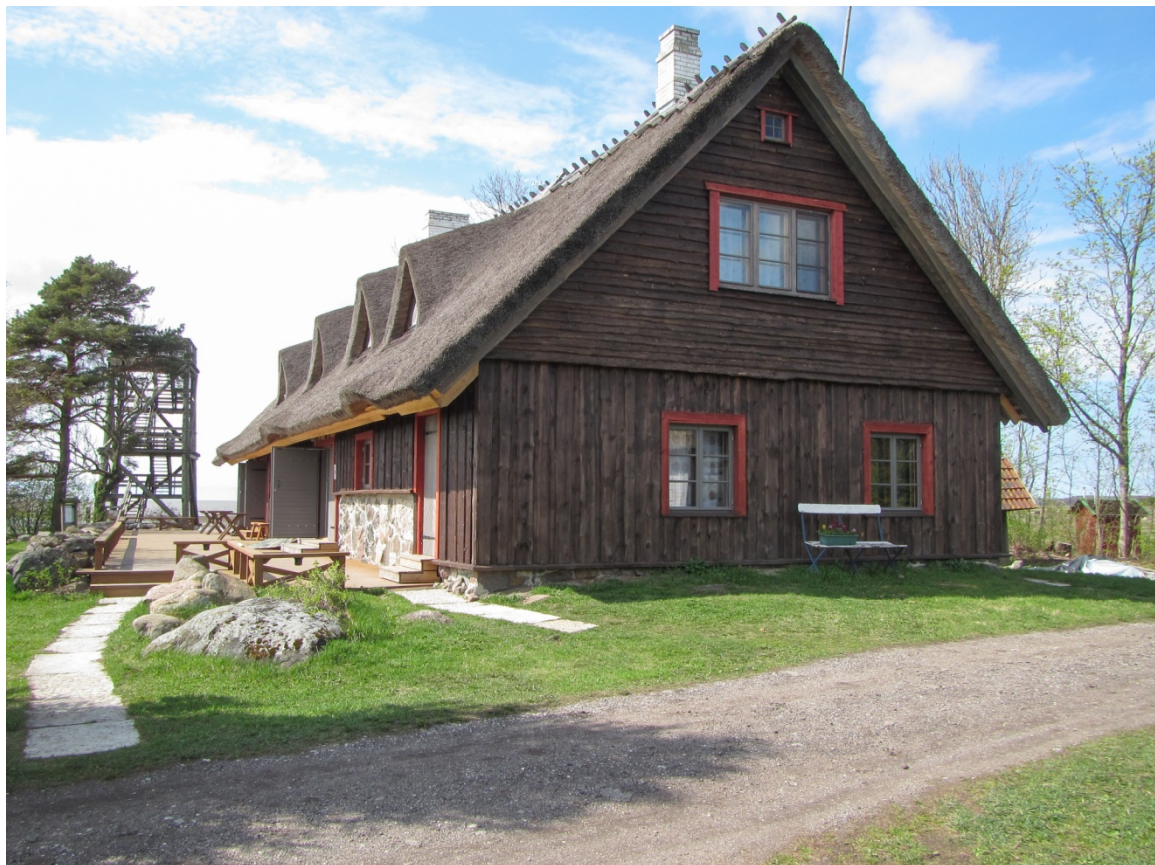
New, but traditionally constructed, café adjacent to the observation tower on the Haeska shoreline