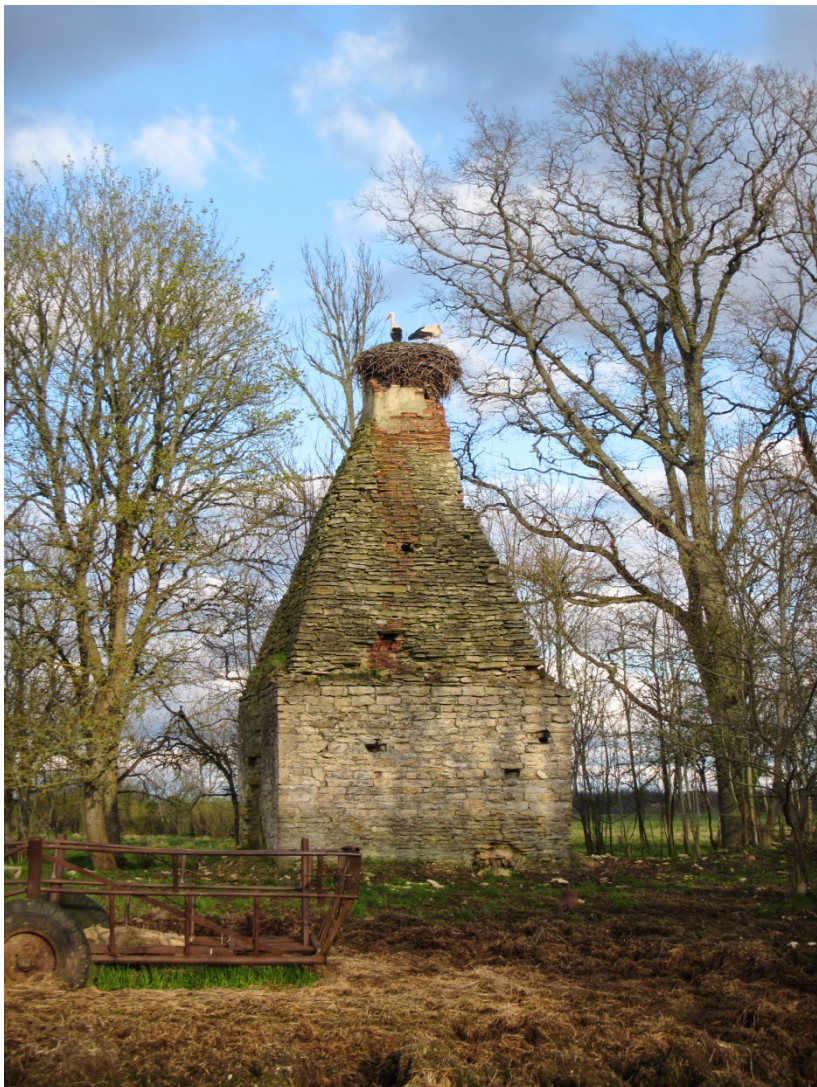
Picturesque White Stork nest site atop an old kiln [Vanamõisa sild manor house]