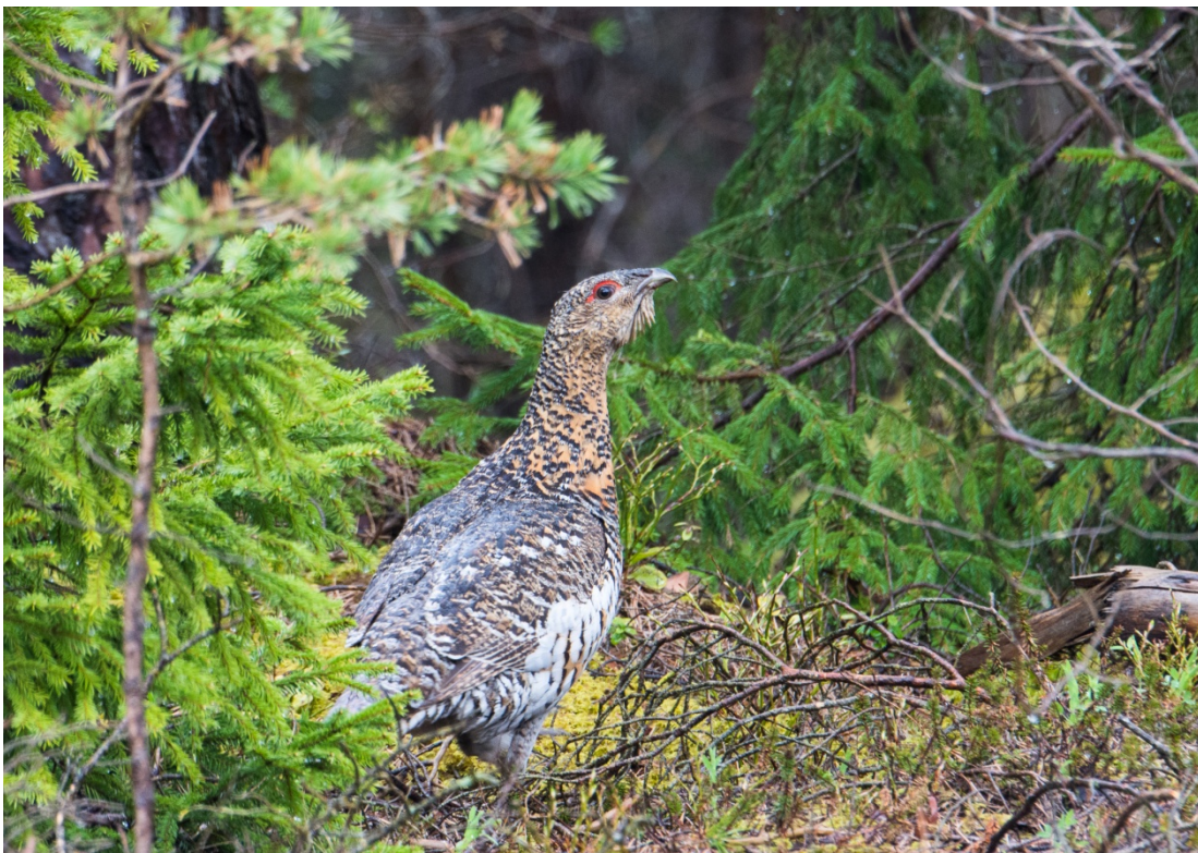
European Capercaillie (f) [roadside between Nõva and Änglema]