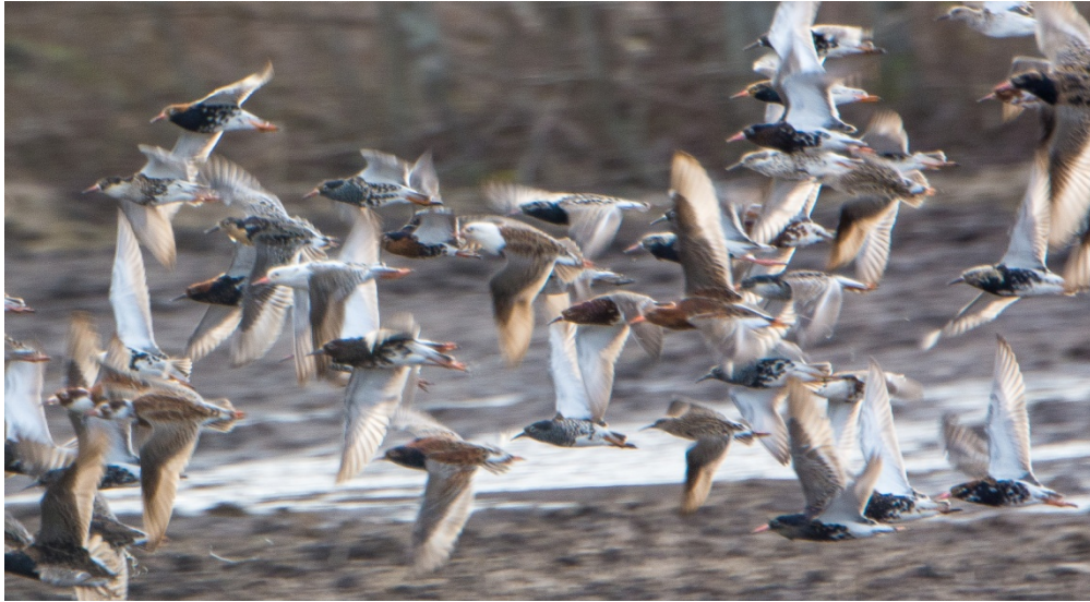
Ruff's in a variety of breeding plumage colour combinations [Roadside fields near to Haeska]