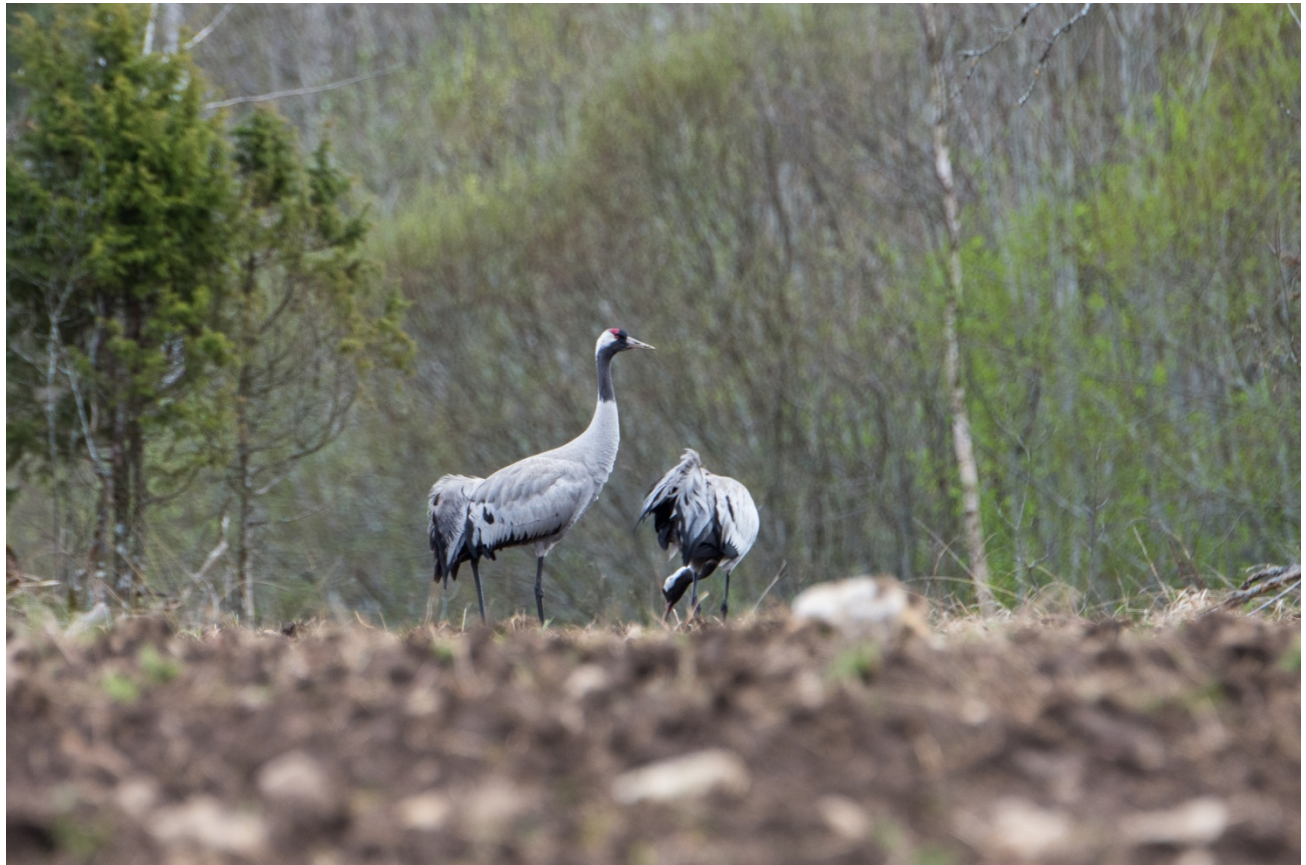
Common Cranes [roadside fields near to Haapsalu]