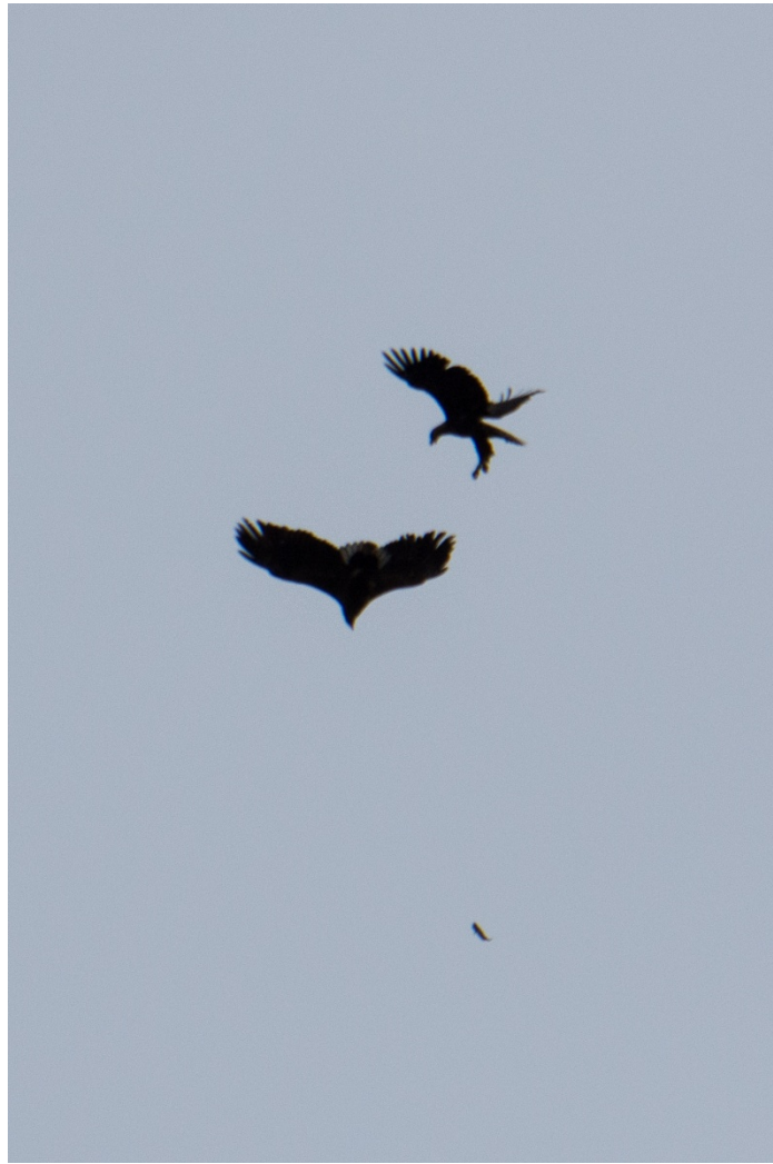
White-tailed Eagles disputing a falling fish [from the Tahu vaaterplatvorm (observation tower)]