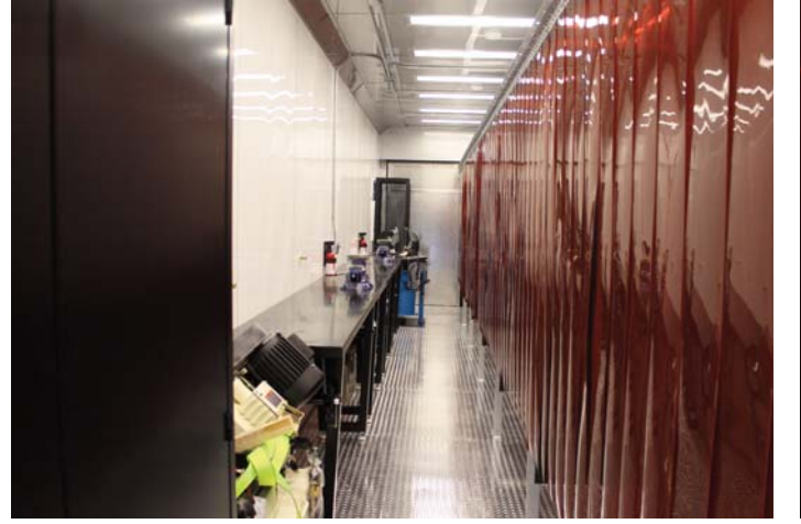
Interior View - Rear of Live Welding Trailer