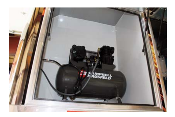
20 Gallon Air Compressor

Standard Products...Designed to Meet Your Growing Needs!