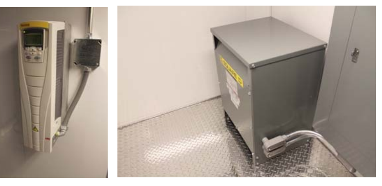
Exhaust Speed Controller