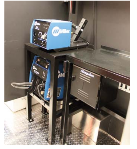
Multi-Purpose MIG/TIG Welding Station (6)