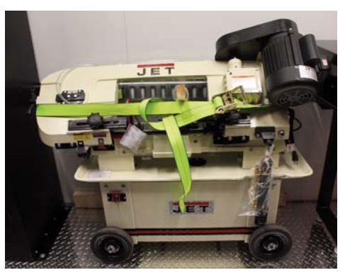
Portable Horizontal Band Saw