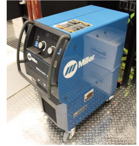
MIG/Pulsed MIG Welding Station (1)