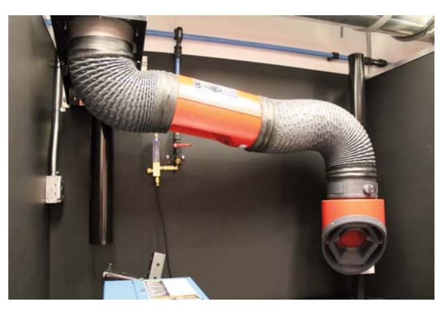
Ventilation Exhaust (One for each station)