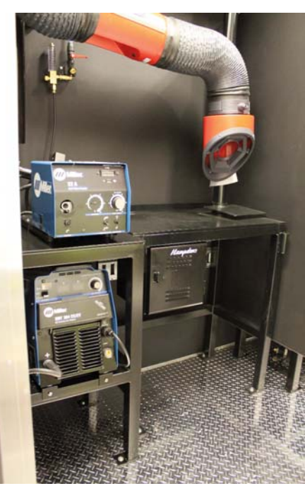
Ventilation Exhaust and Bench Setup