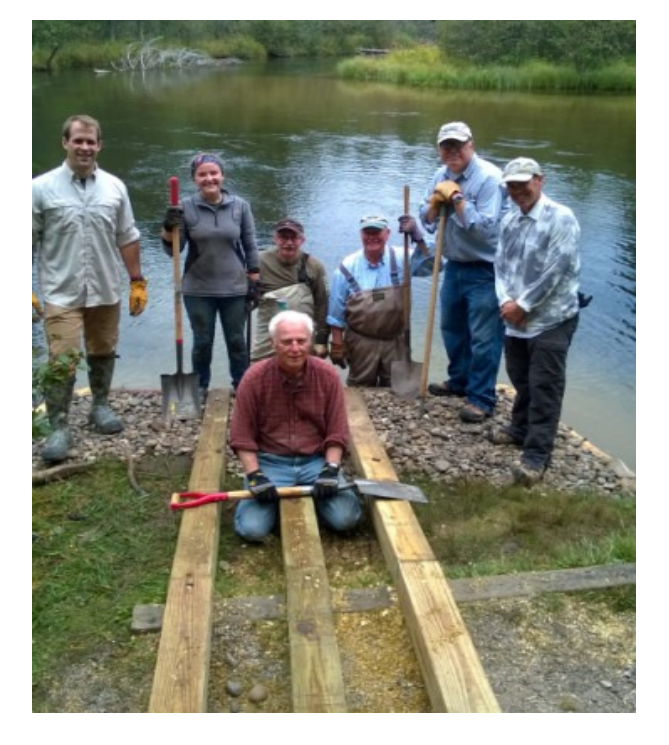
Hole in the Fence access site after