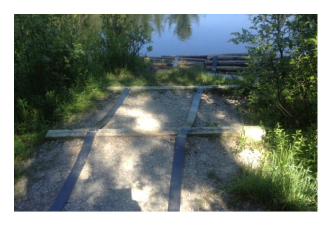
Hole in the Fence access site before