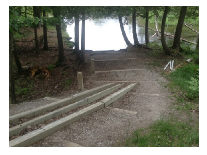
Hole in the Wall access site before

and rock into the rock cribs at each site. The timber extension slide rails had been put in place earlier by the SEEDS organization workers. All in all, both access sites are much better off. In addition to these river work and cleanup activities many volunteers worked with Howard Johnson, from Cedars for the AuSable, to plant trees in the Deward area. Thanks to all for their efforts on another very productive and successful river clean up and work day.