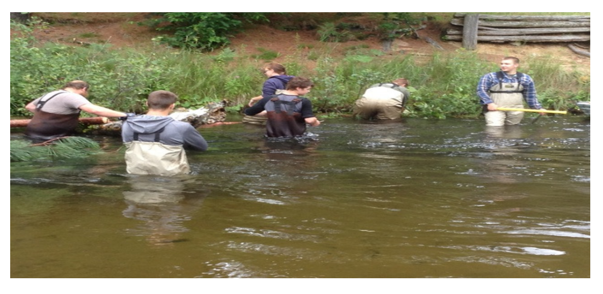
SEEDS Team working in the River

The Upper Manistee River Restoration Committee (UMRRC) has been busy. A representative from the committee walked the river and identified over 65 different locations from C.R. 612 downstream to just above Longs Landing where HIA fish habitat work was completed during the 2014 summer. North Pointe Fisheries consulting was also involved to input their expertise. Permits from the DEQ and DNR were completed by UMRRC and approved. Of the 69 sites identified more than 50 sites were completed. Crews to do the work were from the SEEDS 501 (c) 3 organization which operates out of Traverse City. The SEEDS organization provide summer employment for area high school students. The crews are supervised by adult counselors, and for the river work on the various locations a representative from UMRRC worked daily with the crews. More fish habitat and river work is scheduled for summer 2015 in the River section between M72 and the Yellow Trees Landing.