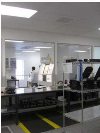
Cardinal Health Nuclear Pharmacy