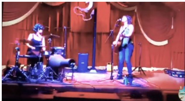
Drop Dead Dangerous