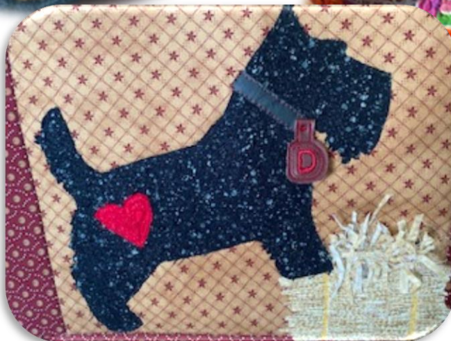
← Shelley Ingram