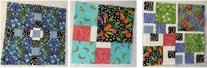
Skewed blocks due to my poor photography skills

Here are a few of the blocks that I made.