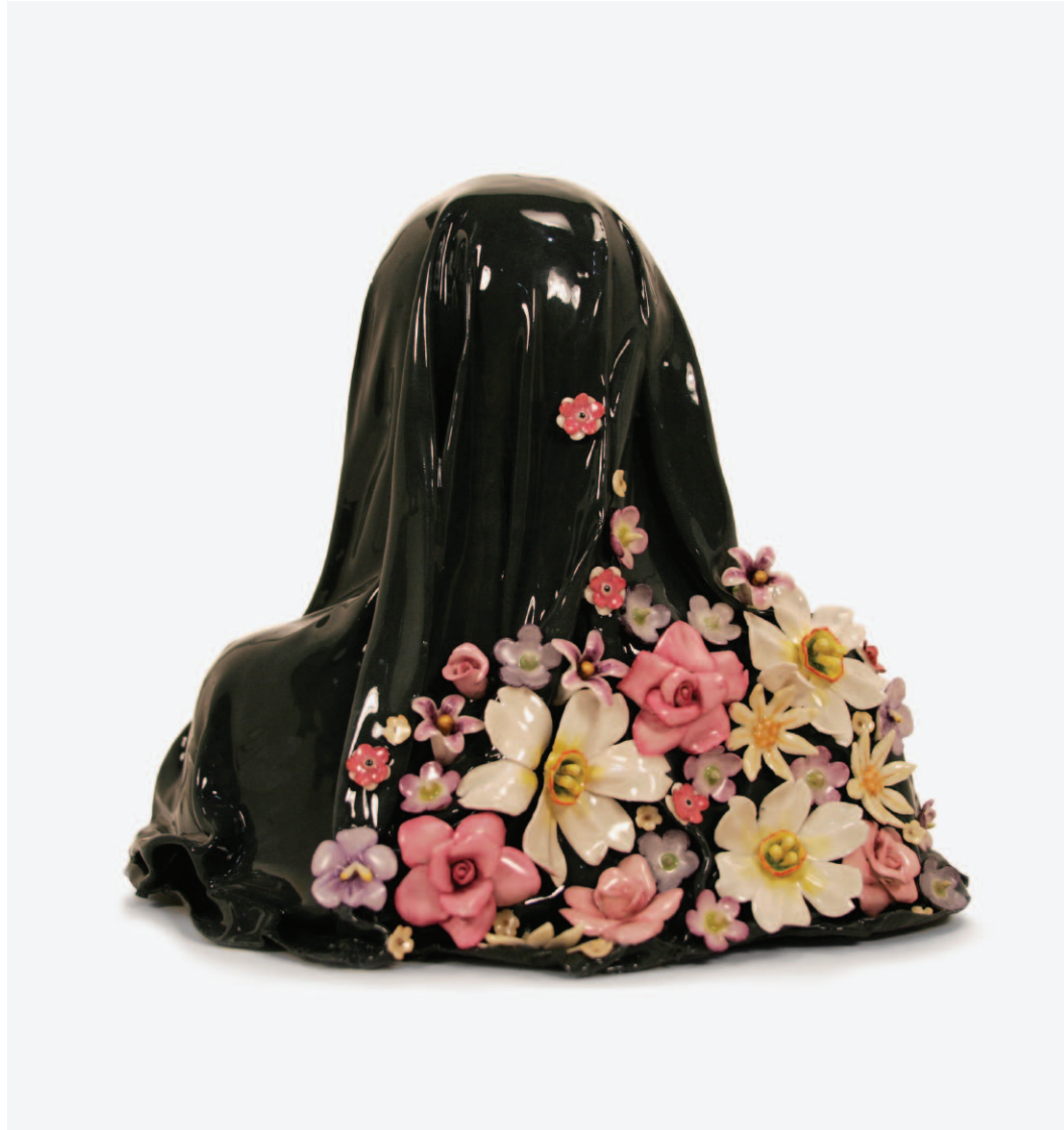
Untitled (Hooded Bust) 2011 Porcelain, china paint 8.5" x 10" x 7" inches