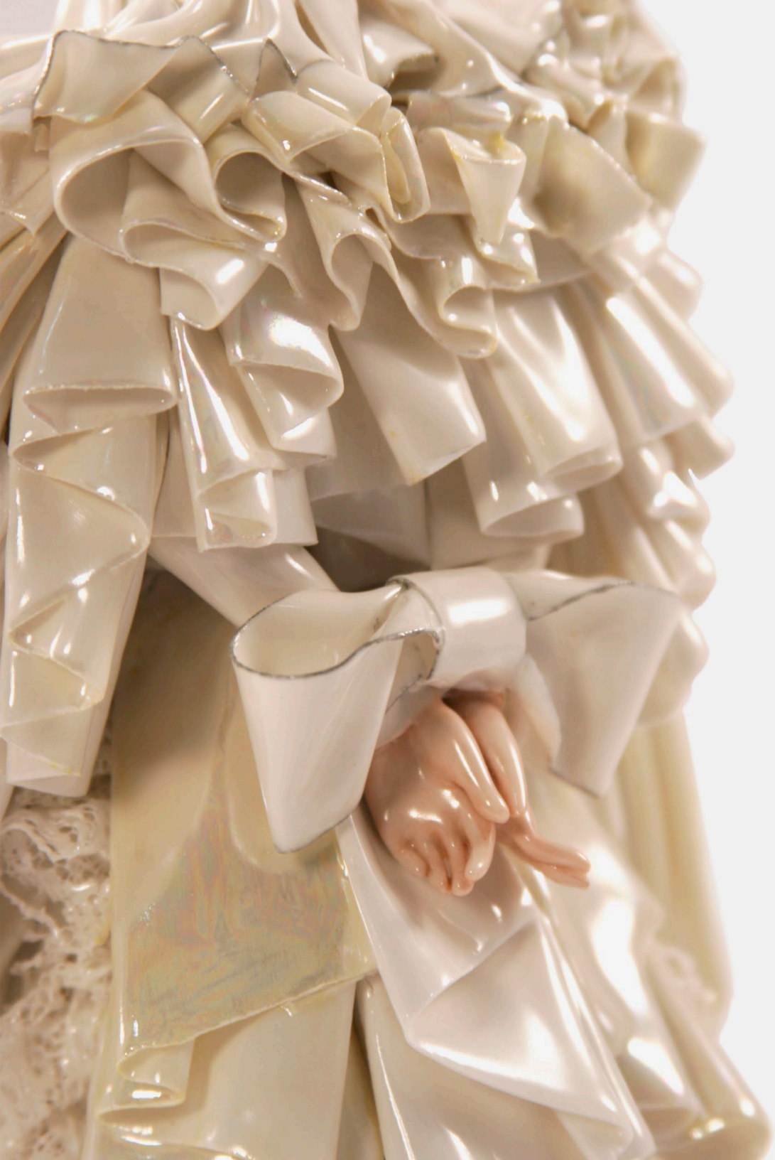
Untitled 2012 Porcelain, china paint, luster 10"x 6"x 8.5" inches