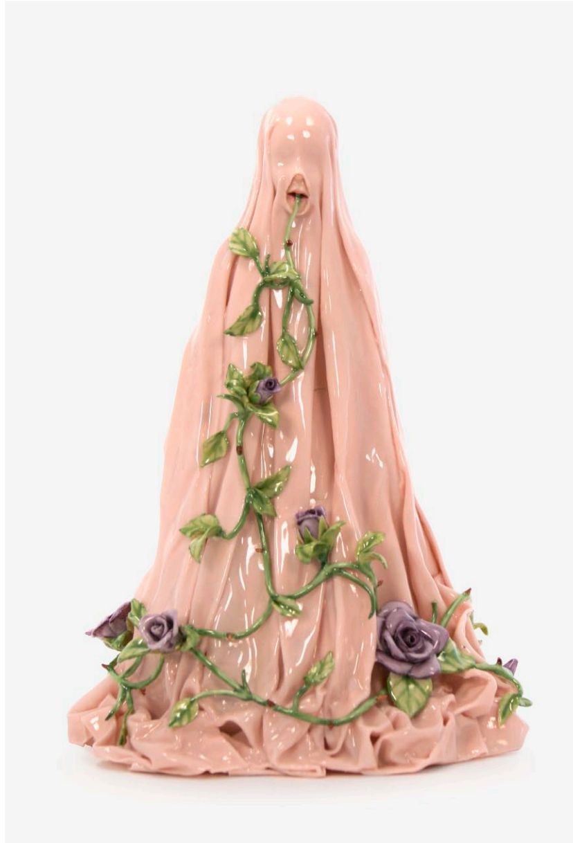
Untitled 2010 Porcelain, china paint 9" x 7" x 5.5" inches