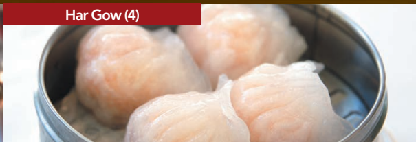
Har Gow (4)