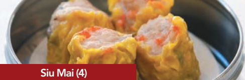
Siu Mai (4)