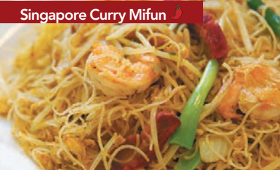
Singapore Curry Mifun 🍲