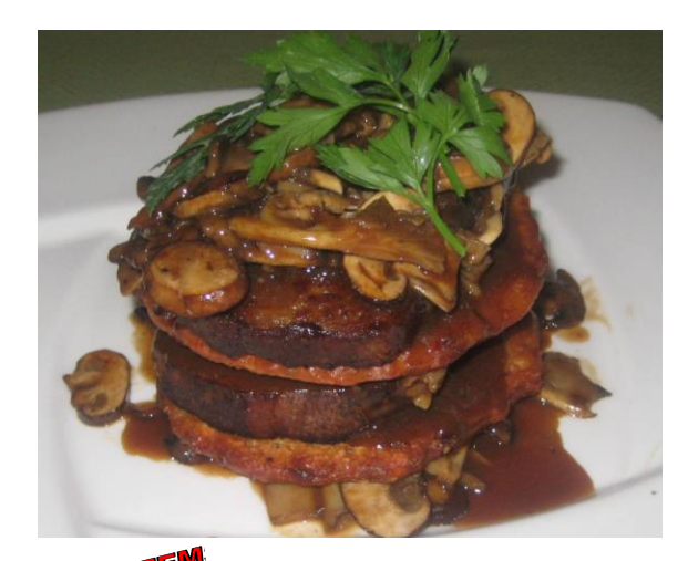
MEAT LOAF STACKER Homemade Meat Loaf Layered with Potato Pancakes

Served With Soup and Salad Bar, Choice of Potato or Rice, Vegetable, Rolls & Butter Substitute Potato for Spaghetti or Potato Cake Add $ 1.25