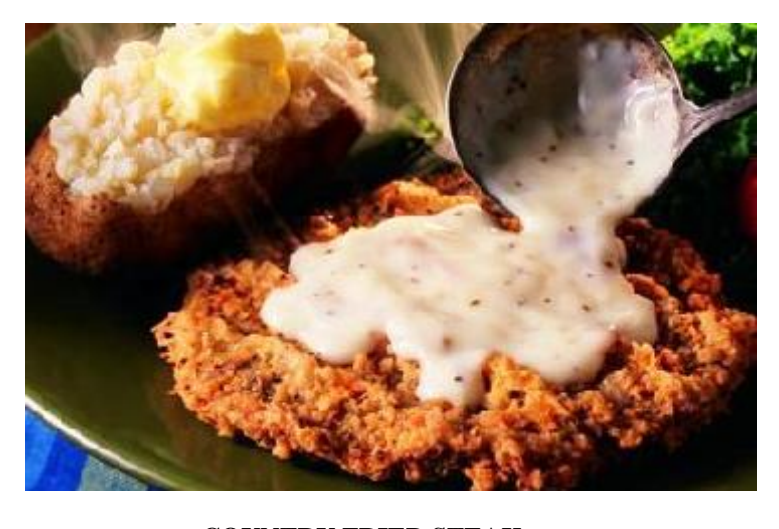
COUNTRY FRIED STEAK Breaded, Deep Fried Topped With Gravy