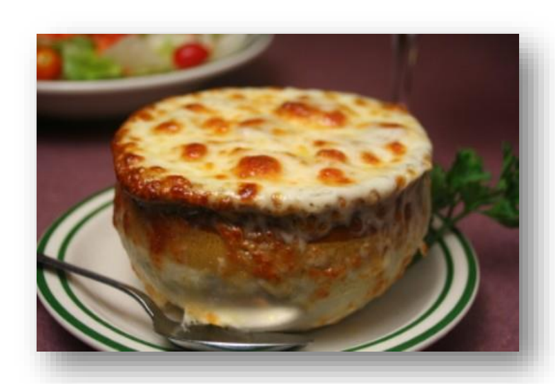
FRENCH ONION A Classic Beef Broth Loaded With Caramelized Onions Topped With Seasoned Croutons and Melted Mozzarella Cheese

We Create Our Own Spicy Mouth Watering Chili Loaded With Diced Onion & Cheddar Cheese