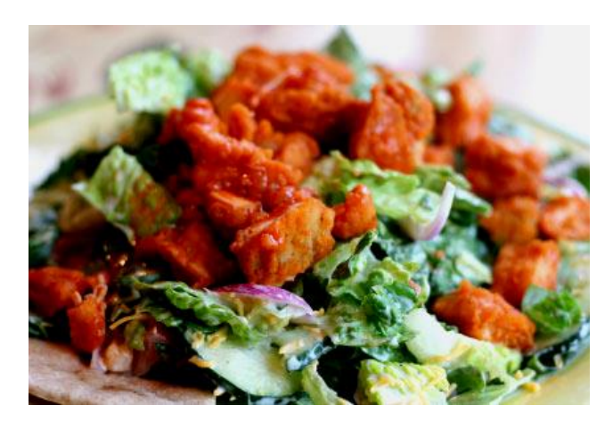
BUFFALO CHICKEN SALAD Buffalo Style Chicken Finger

CHEF SALAD Strips of Turkey, Ham, American And Swiss cheese