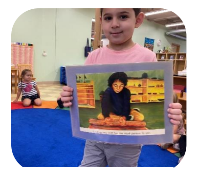
Grace and Courtesy

Grace and courtesy lessons are a critical part of our environment. The teacher and child role model these various lessons each day. A leader is chosen for the day. This is a wonderful way to help the child gain confidence and model how to set a good example for others to learn.