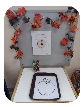
Anatomy of an apple

The children also participate in floral arrangements each week. This activity is a wonderful way to connect the child with their environment as well as one another. Not only does it make the environment beautiful, but the work also allows the child to gain knowledge and an appreciation for each flower.