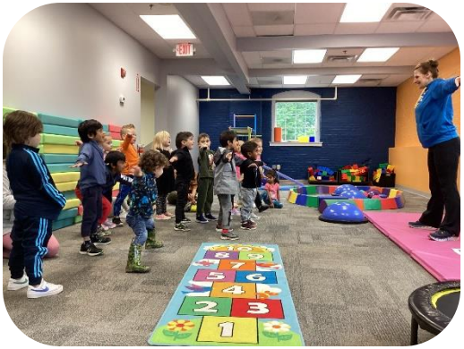
Fun at Sensation Station!