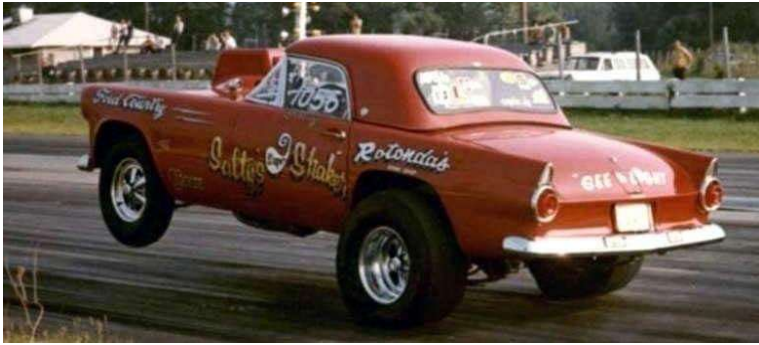
Local Jersey TBird

7/30/1863 Henry Ford was born 7/3/45 1st postwar Ford came off the assembly line 7/15/55 1st production day - Mahwah NJ