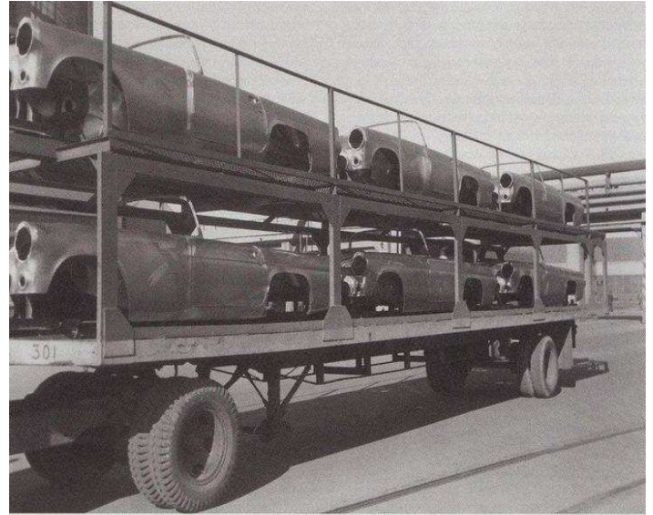
Fresh from Budd's Detroit plant, six 1955 bodies-in-white were brought to the Dearborn Assembly/Rouge plant, Ford Motor Company