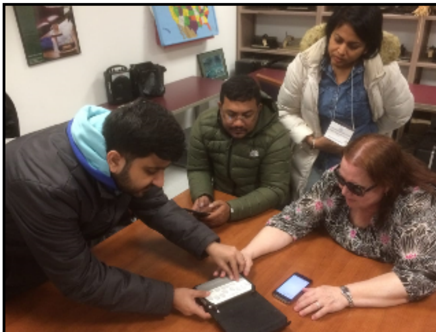
The team at Perkins School, exploring the library for people with visual impairment

Next city we visited was Denver. The first meeting was with Colorado cross Disability coalition, where people with various Disabilities work and