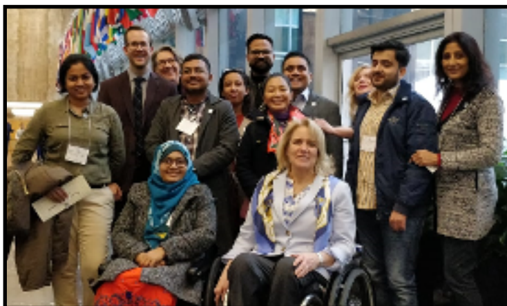
The team with US Department officials

In Jacksonville, visited Jacksonville's Disabled Services Division which works on accessibility issues such as transportation, employment, housing, recreation and other areas. We had an opportunity to visit Florida Service Dogs inc. founded and directed by Veterans, which is also a non profit working on education, Advocacy, and professional training of service Animals. We also made a visit to Arc Village which is an independent living unit which has about 40 houses single and double bedrooms for people with physical and cognitive impairments.