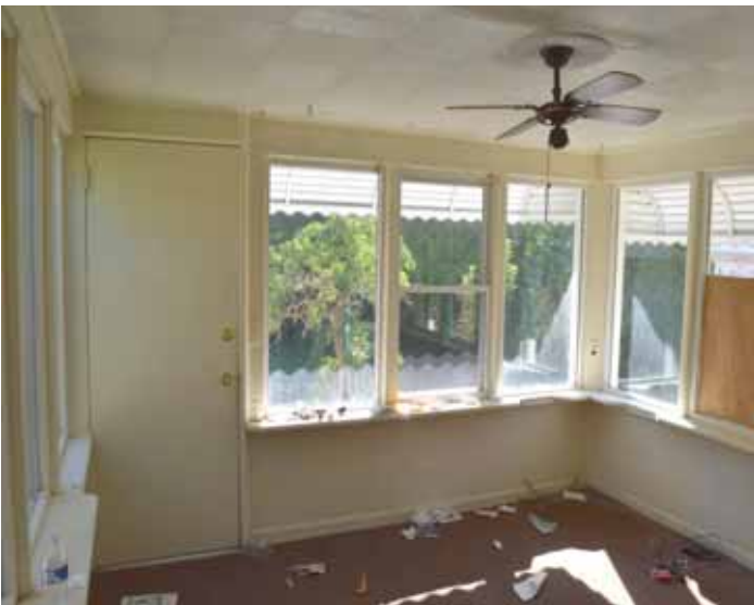
Back porch interior