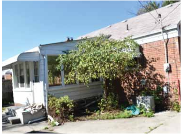
Rear view of House