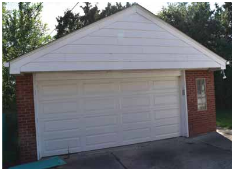
2-car Detached Garage