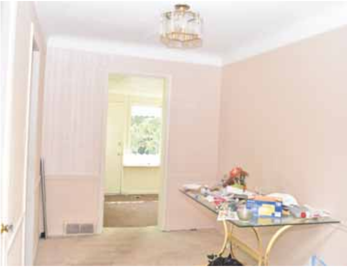
Dining room view to back porch