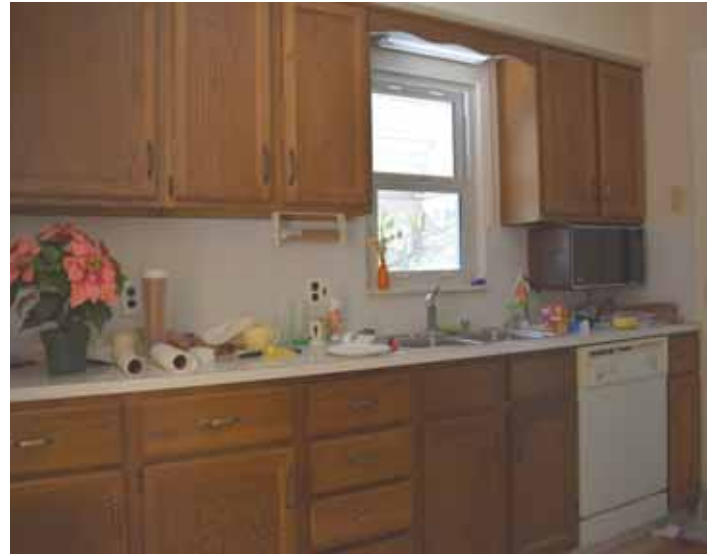
Kitchen view 2