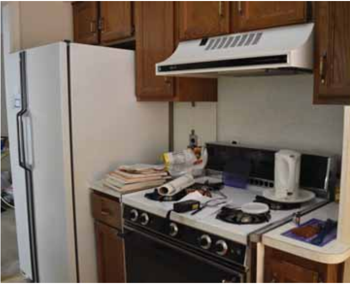
Kitchen view 1