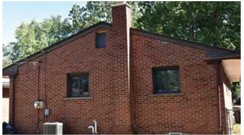
Back view of house