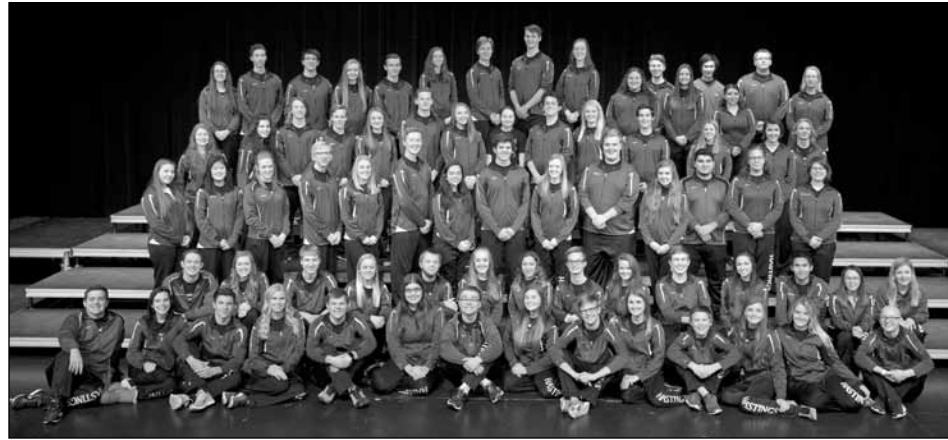
Riverside Company from Hastings High School in Hastings, Minnesota was crowned Grand Champion of Competition of Excellence for the third year in a row.

Westside hosted the 17 th annual Competition of Excellence on Saturday, January 28 th . The weather was welcoming this year, allowing the 25 choirs from five states and 13 schools to compete in this one-day event. The day started very early for many of the 250+ volunteers who helped make this event a huge success. With so much going on behind the scenes, everyone played a key role to keep this very busy day running smoothly. Whether they baked brownies, prepared food in the cafeteria, worked backstage setting up risers and coordinating performers, or organizing parking, everyone helped the day proceed seamlessly.