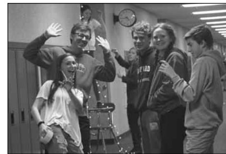
Westside's show choir members "hard at work" getting the homerooms ready for our guests...

After school on Friday, Westside show choir students decorated classrooms that served as each choir's "homeroom" during the competition. Meanwhile, their parents set up the rest of the school in preparation for the