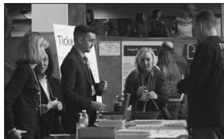
...while parents prepare the rest of the school for the big day.

following day's event. Many returned as early as 4:30 a.m. on Saturday to prepare breakfast items and greet the first bus, which arrived around 6:15 a.m. Exc!amation, Elkhorn High School's Prep Division choir was the first to perform at 7:20 a.m. Show choir competitions usually include