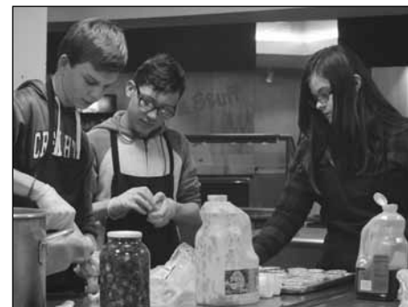
Fixing enough food to feed an army, or a hungry horde of show choir fans.