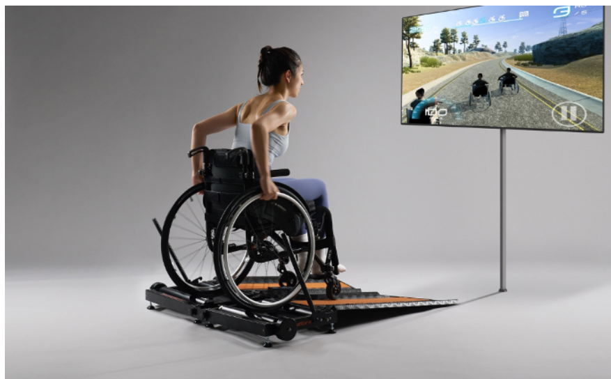
Picture shows a person on wheelchair using the wheely x

https://global.kangsters-crew.com/index.html#none