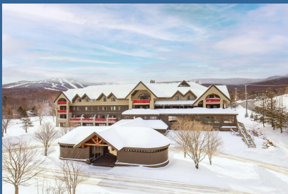
Killington Mountain Lodge