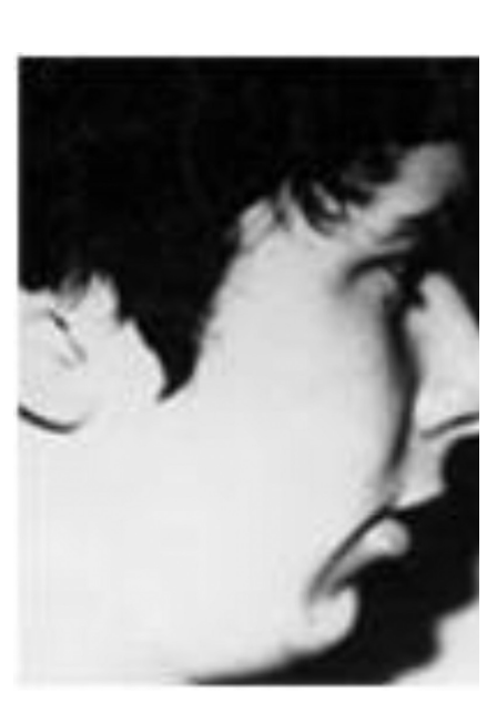
Figure 1: The patient aged 10