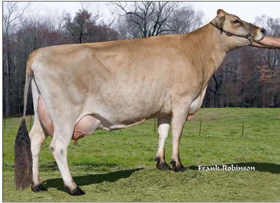
DISMUKES MAXIMUS BERTHA, E-90% SISTER TO THE GRANDAM OF LOT 395