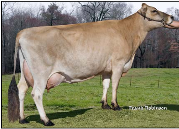
DISMUKES MAXIMUS BERTHA, E-90% GRANDAM OF LOT 408