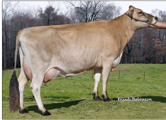
DISMUKES MAXIMUS BERTHA, E-90% DAM OF LOT 457