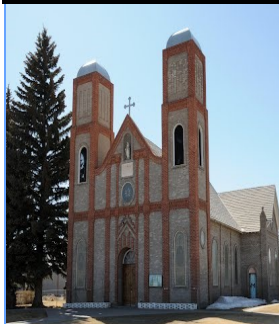
Our Lady of Guadalupe Parish Oldest Parish in Colorado Established in 1858