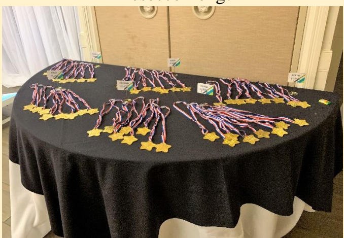
Gold medals for everyone!