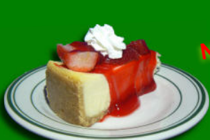
New York Cheesecake