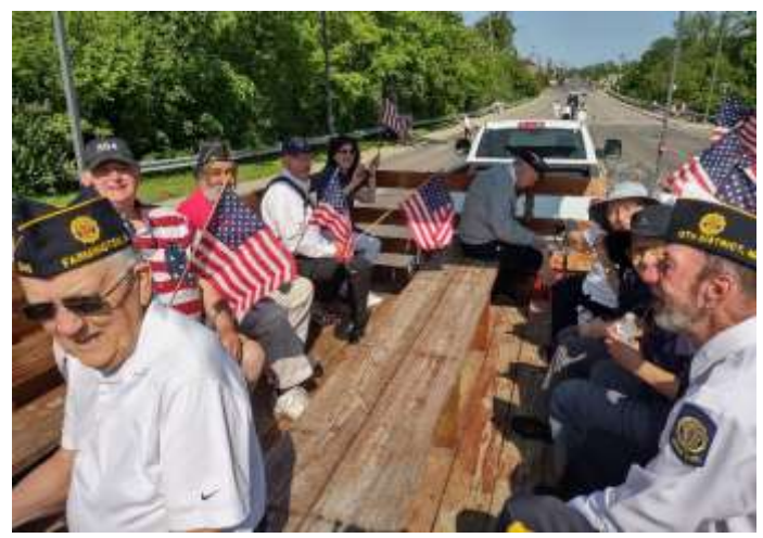
Legion, Auxiliary, & VFW members who couldn't walk the parade route had lots of fun riding in the Oakland County Parks & Rec wagon.