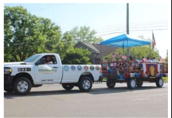
Special thanks to Oakland County Parks & Rec for the loan of their wagon for us to decorate for the parade and to Weingartz Lawn Equipment for towing it.