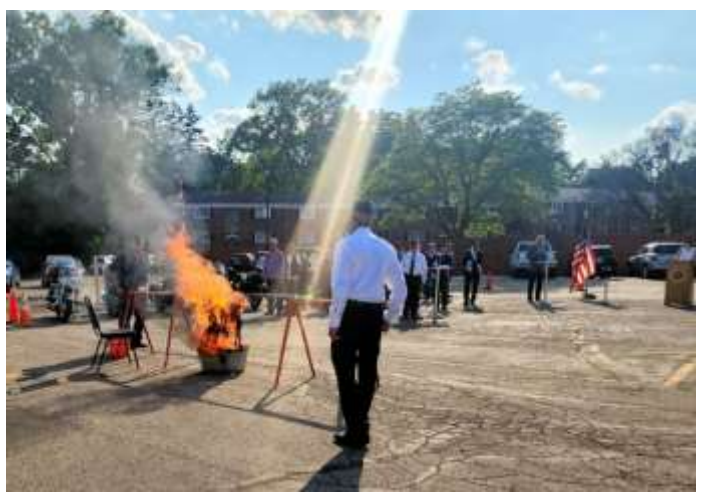
Awe inspiring display on a beautiful spring day.

The 2023 Flag day ceremony was well attended by Post officers, members, Knights of Columbus, Dept. of MI officers, and our Chapter 346 Legion Riders.