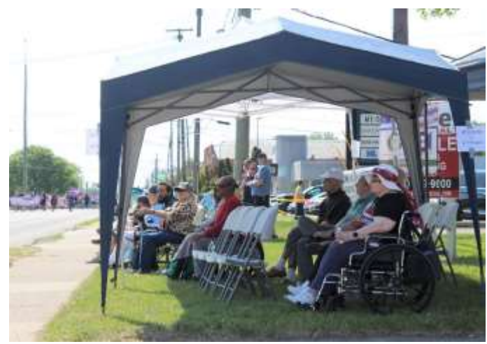
Our special guests from American House Senior Living Community enjoyed the parade and open house from the comfort of shady cabanas.