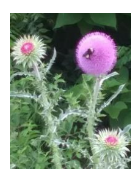
Bumble Bee on thistle 6/7/18

Vitex, or Chaste Tree, has also begun its blooming period. Given adequate moisture, the Vitex will bloom for an extended length of time and will also repeat blooms later in the fall. This small tree is a honey bee magnet.