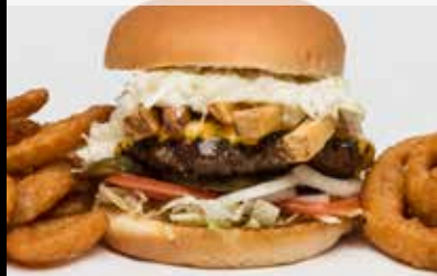
Ship, Captain & Crew