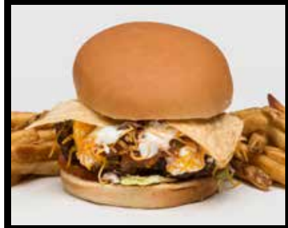
Taco Chipso Burger

Our burger topped with o-rings, lettuce, tomato, cheese sauce and dock sauce. Sandwiched between 2 bacon grilled cheese sandwiches with American & swiss cheeses single 10.29 Make Double 3.00 or Triple 6.00