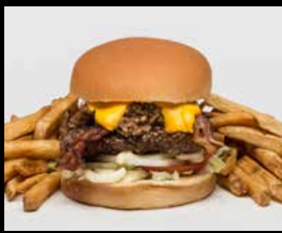
The Big Bacon Lucy

Our burger with mashed potatoes, gravy, grilled onions and mushrooms & mozzarella 8.28 Make Double 3.00