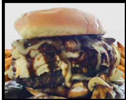
Mashed Potato Burger

Our burger, bacon, grilled onions, mushrooms, mozzarella cheese & dock sauce 7.78 Make Double 3.00