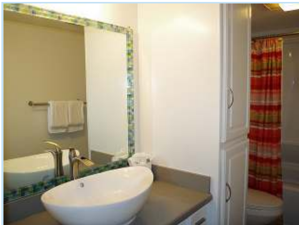
new countertop and sink