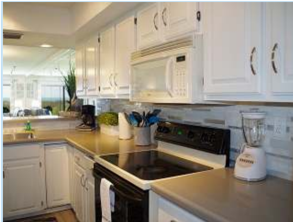
all new custom cabinets