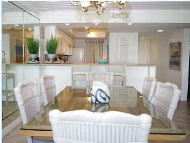
seating for 6