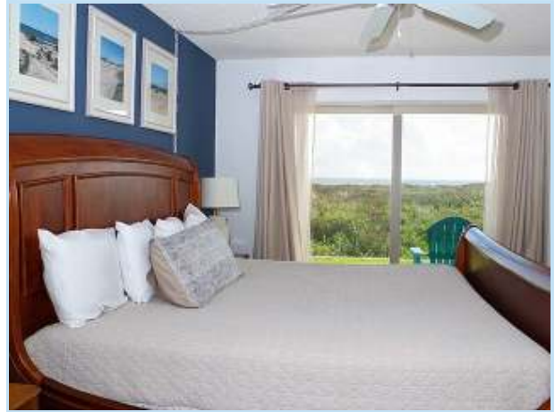
access to patio from master