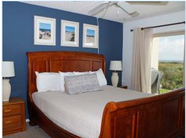
all new furniture in master bedroom