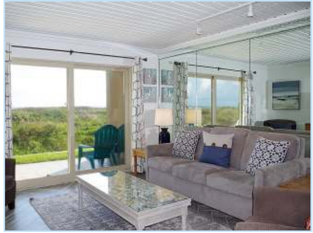
mirror doubles the ocean view