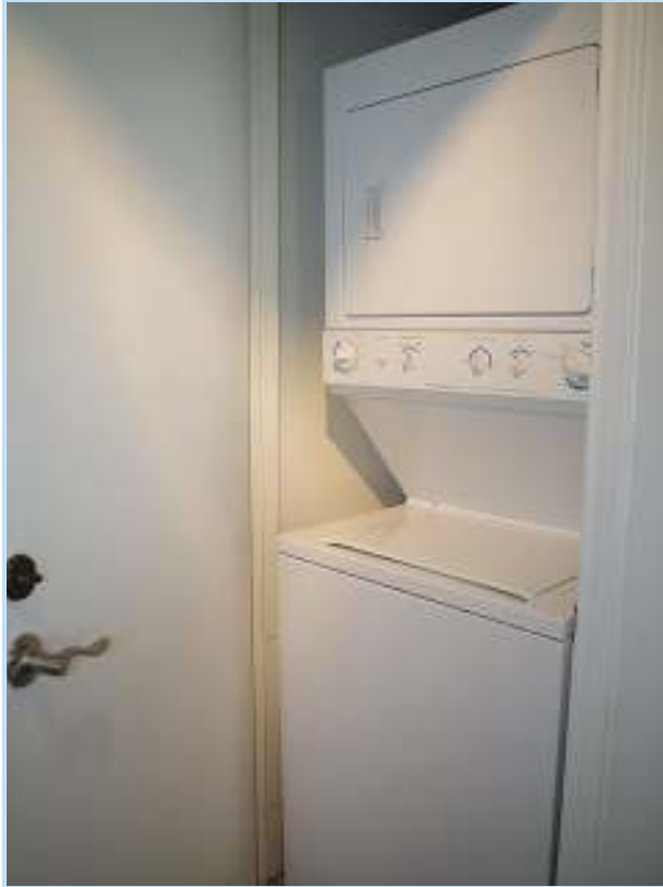
convenient in-unit washer/dryer