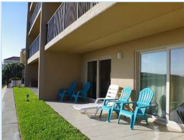
patio with ocean view