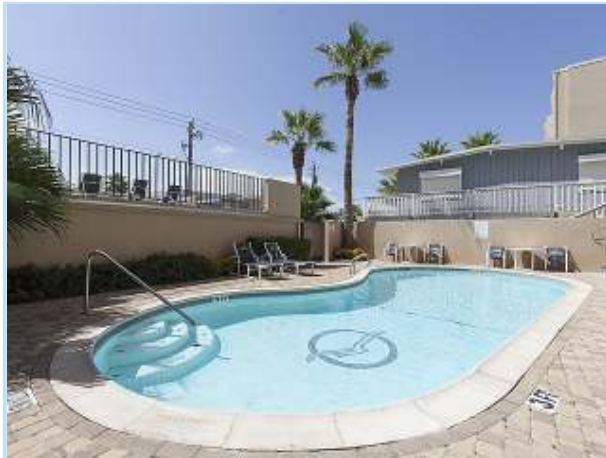
Seagull pool is heated