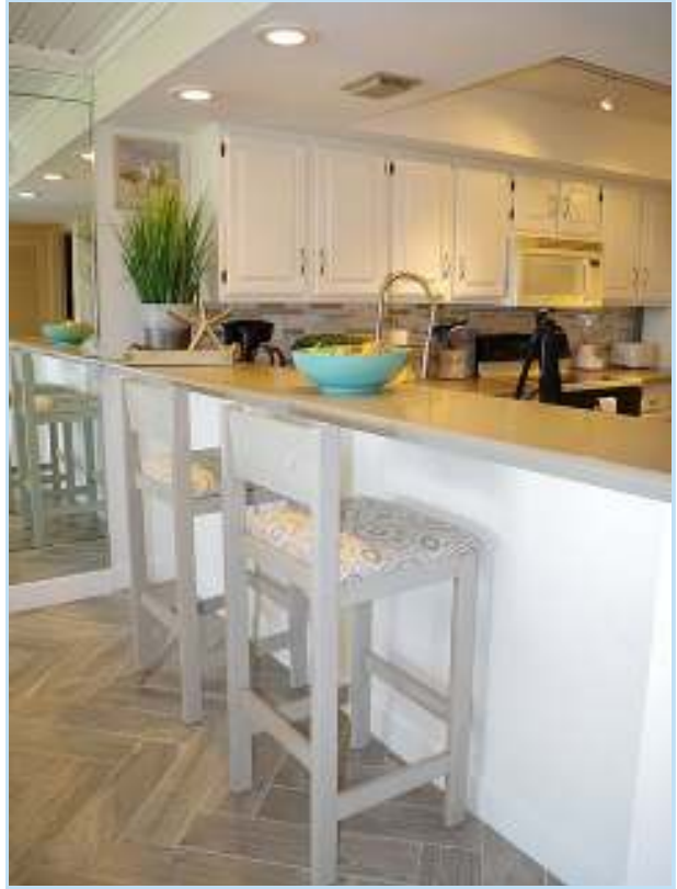
additional seating at kitchen counter