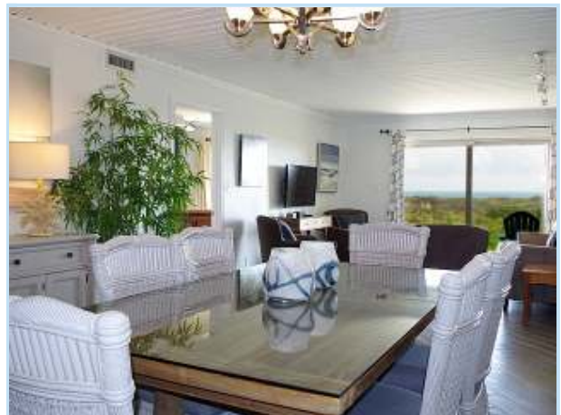
all new furniture in dining room