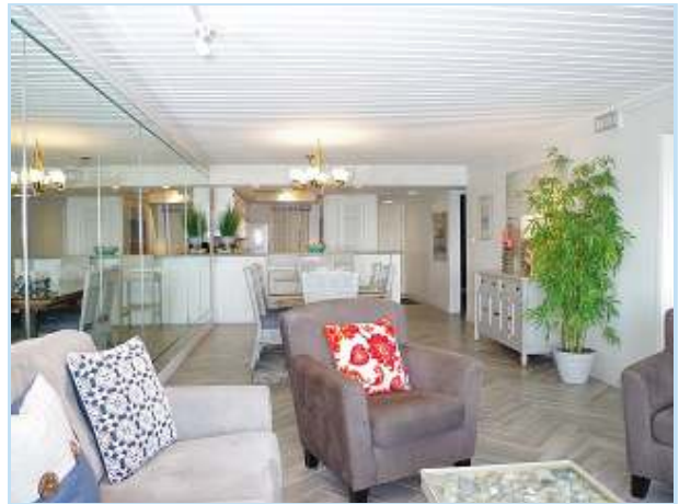
herringbone pattern tile