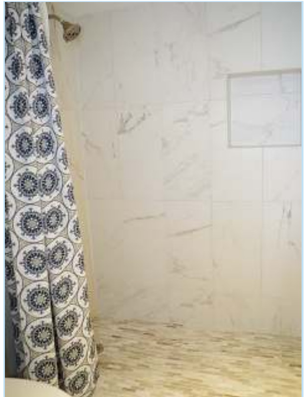
new custom tiled walk-in shower