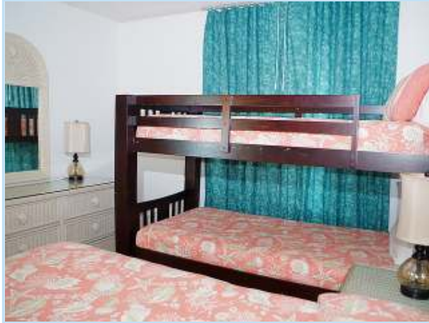
guest bedroom sleeps 4