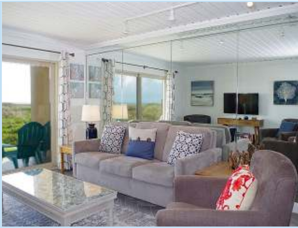
all new furniture in living room