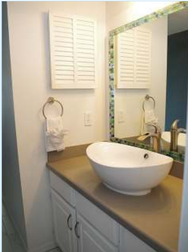
new countertop and sink