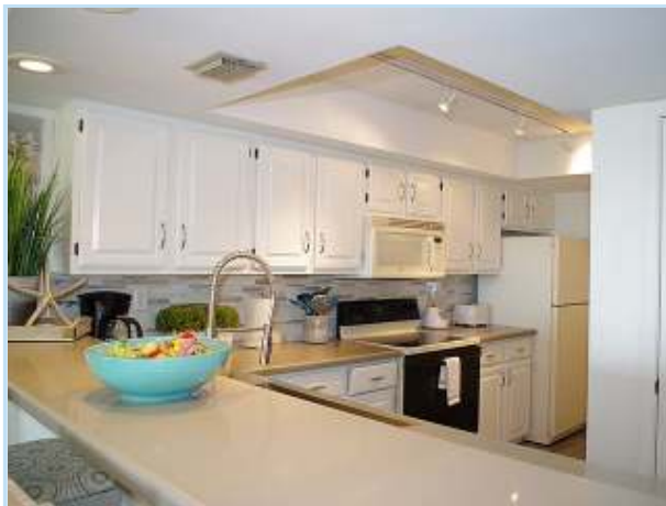
gorgeous new countertops