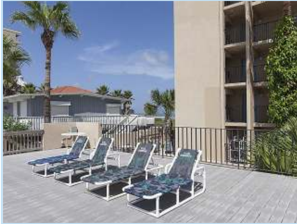
west-facing sundeck above pool