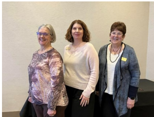
NCCW 2024 Convention