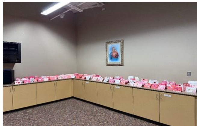
St. Thomas More CCW making valentines.