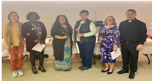
Blessed Sacrament CCW Officer Installation