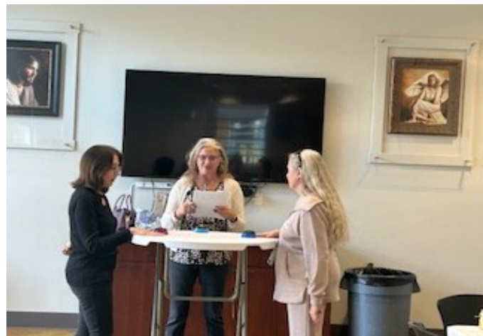
St. John the Baptist CCW