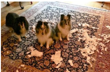
Pilot, Tobin and Sawyer (Sandra & Cliff Green)

Sandra Green wrote: TP mischief taken to a whole new level today. The pups carried a brand new roll of TP out of the master bathroom and proceeded to shred it to bits.