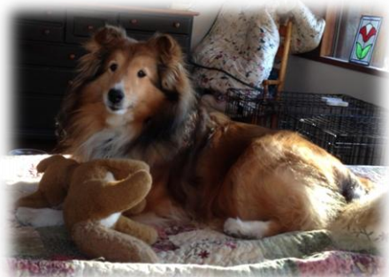
Cuddling with her stuffed fox