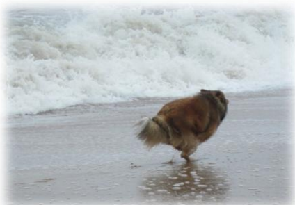
Sheer joy, barking at and herding waves