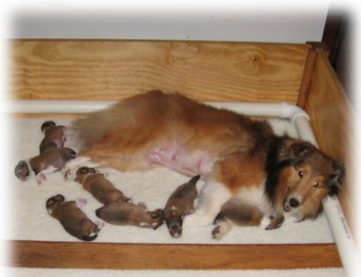
"Motherhood with her seven beautiful puppies"

They have wonderful memories Cinder, as shown below.