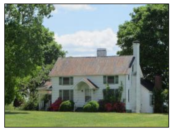
NCDOT Survey #24, Boon(e) House (GF-8186), looking northeast.

Location and Setting: The Boon(e) House at 6902 Burlington Road is located on the south side of twolane US 70, west of its intersection with NC 61 and Whitsett (Figures 95–104). The main house and outbuildings are set back from the road and the path of a former driveway is visible to the north. The immediate setting consists of a grass lawn planted with some fruit trees and mature shade trees. Flowering shrubs are planted along the north face of the house. Although currently vacant, the house and outbuildings were not accessible for interior inspection and photography.