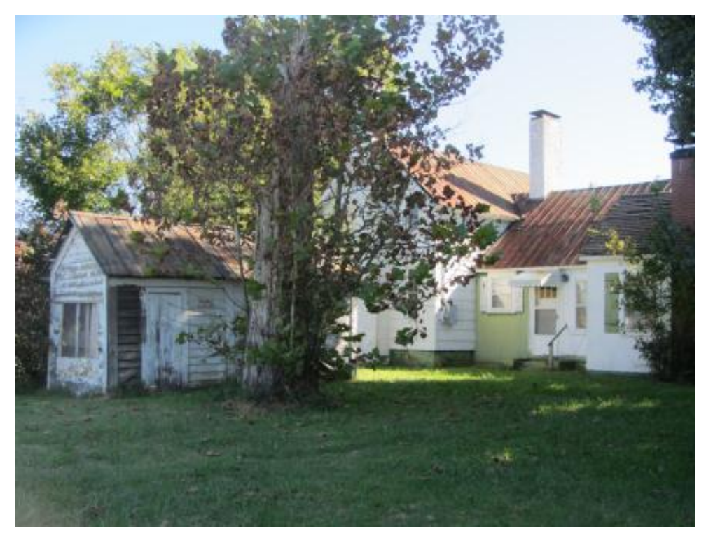
Figure 102. NCDOT Survey #24, Boon(e) House (GF-8186), 6902 Burlington Road, Guilford County, setting, showing relationship of unknown domestic outbuilding on the left with main house, rear hyphen and rear wing on the right, looking northeast.