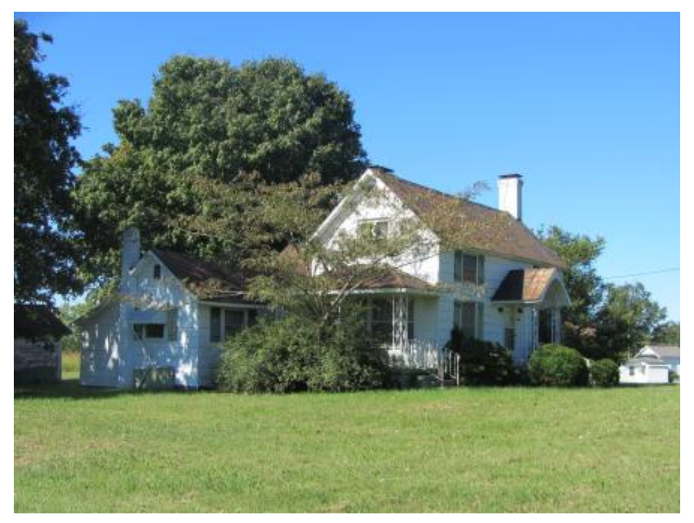
Figure 98. NCDOT Survey #24, Boon(e) House (GF-8186), 6902 Burlington Road, Guilford County, main house, north façade, and east gable end with east addition visible on left, looking southwest.