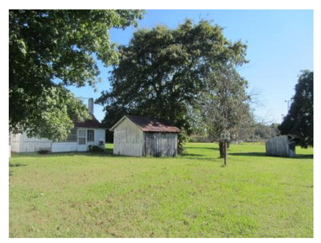
Figure 99. NCDOT Survey #24, Boon(e) House (GF-8186), 6902 Burlington Road, Guilford County, setting, showing yard west of main house, looking south/southeast; rear addition of main house is on the left, small utility shed in center, smaller chicken house on the right.

Figure 98. NCDOT Survey #24, Boon(e) House (GF-8186), 6902 Burlington Road, Guilford County, main house, north façade, and east gable end with east addition visible on left, looking southwest.