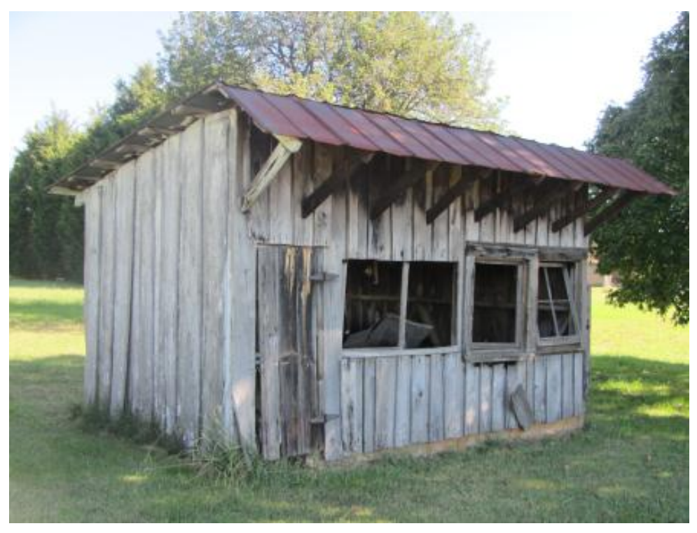
Figure 100. NCDOT Survey #24, Boon(e) House (GF-8186), 6902 Burlington Road, Guilford County, outbuilding, probably a chicken house, south façade, looking northeast.