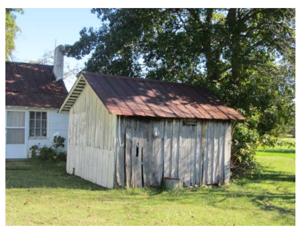
Figure 103. NCDOT Survey #24, Boon(e) House (GF-8186), 6902 Burlington Road, Guilford County, utility shed located west of rear wing of main house, looking southeast.

Figure 102. NCDOT Survey #24, Boon(e) House (GF-8186), 6902 Burlington Road, Guilford County, setting, showing relationship of unknown domestic outbuilding on the left with main house, rear hyphen and rear wing on the right, looking northeast.