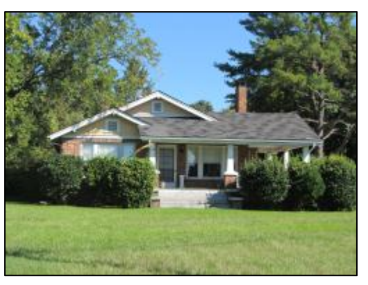
NCDOT Survey #26, Hoffman House (GF-8187), 6805 Burlington Road, looking northeast.

Location and Setting: The Hoffman House at 6805 Burlington Road is located on the north side of twolane US 70, west of its intersection with NC 61 and Whitsett (Figures 105–109). The house and garage are set on a small, level property and the Hoffman House property is surrounded by other small residential properties. An unpaved driveway is on the east side of the property and leads to the frame garage located east of the main house. The immediate setting consists of a grass lawn planted with mature shade trees. Foundation