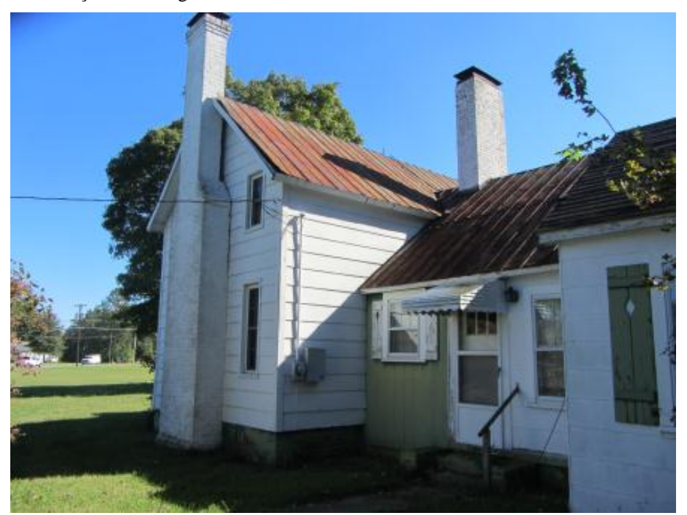
Figure 97. NCDOT Survey #24, Boon(e) House (GF-8186), 6902 Burlington Road, Guilford County, main house, west gable end, with one-story hyphen and part of rear wing visible, looking northeast.

Figure 96. NCDOT Survey #24, Boon(e) House (GF-8186), 6902 Burlington Road, Guilford County, main house, north façade, looking south.