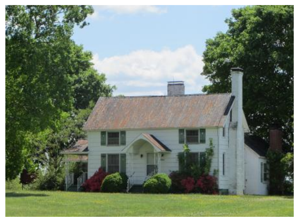
Figure 96. NCDOT Survey #24, Boon(e) House (GF-8186), 6902 Burlington Road, Guilford County, main house, north façade, looking south.