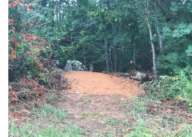
The entrance of the new trail from Cliff Rd. leading to Conroy Ln. and Park Rd.

We will change the event slightly so we can have it. We will not have inflatables but will have other activities and food.