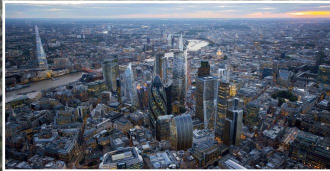
THE 'PLEIADES' PYRAMID CITY COMPLEX

51 degree Great Pyramid angle from Royal Gherkin Pyramid and same dimension from the Gherkin triangle: Shard-Gherkin-Tower 42