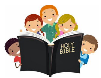
Read God's Word

There is a nursery at the rear of the auditorium up the stairs if you need to care for your infant.