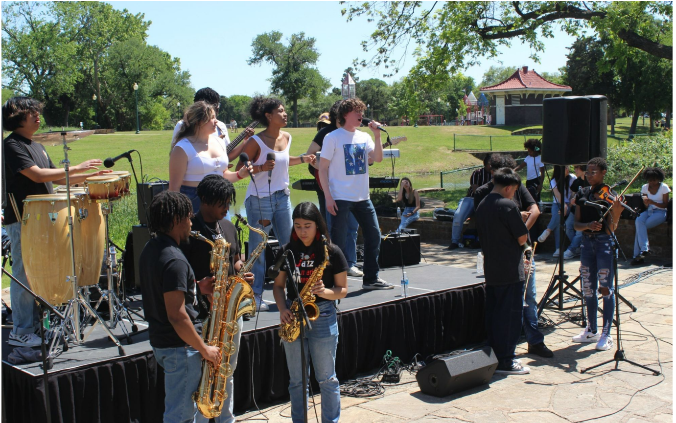
See more pictures at Facebook, https://www.facebook.com/OakParkEstates