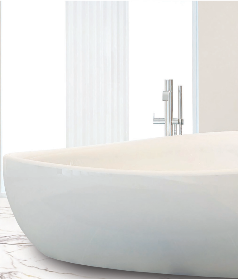
Shown: Carrara 24x48