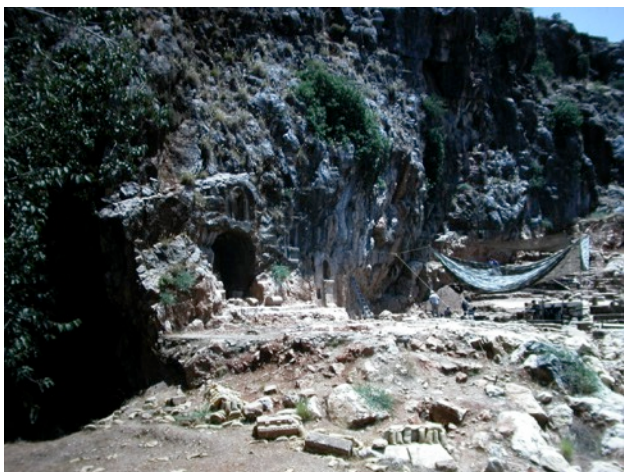
Pnias—Caesarea Philippi in NT times

Seleucid King – Antiochus III conquers Ptolemy's descendants at Panian/Banyas/Caesaria Philippi in 199/8 BC and that starts the next era of the aggressive Hellenization of Palestine which produces the Maccabean Revolt where we will start the NT Class Next SEPTEMBER .