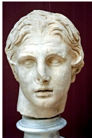
Istanbul Archeological Museum

Alexander represented a change of phenomenal proportions , for it was with his language, ideas and culture that he conquered the world, not his political control. It's like today, American language, movies, clothing and money rule the world. HELLENISM.