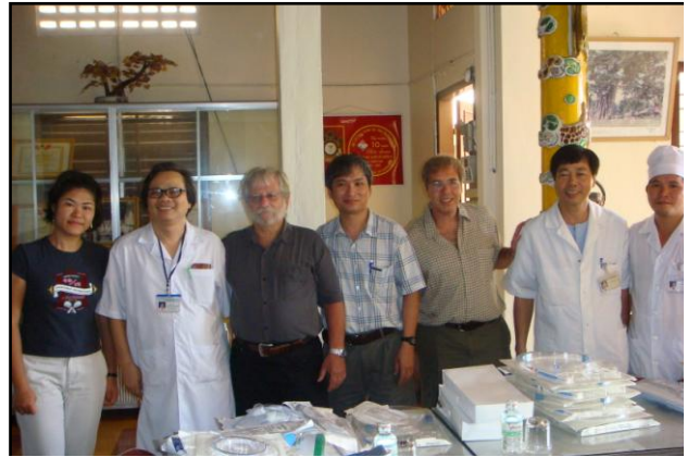
Donation of equipment to Nha Trang province hospital, 2013