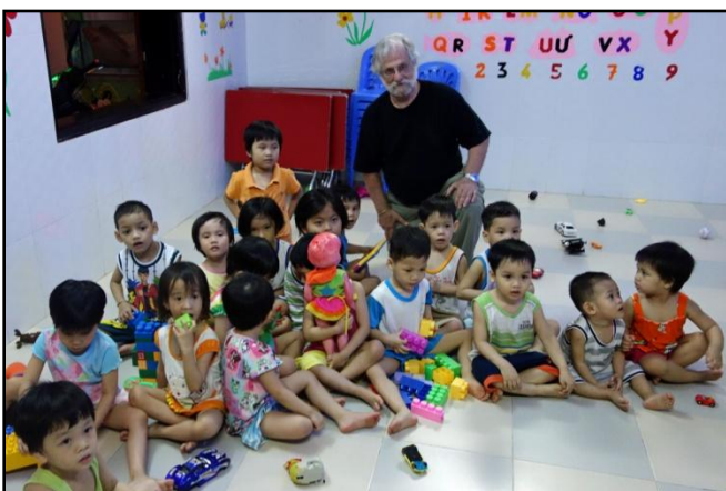
Volunteer orphanage in Nha Trang for newborns to four years of age