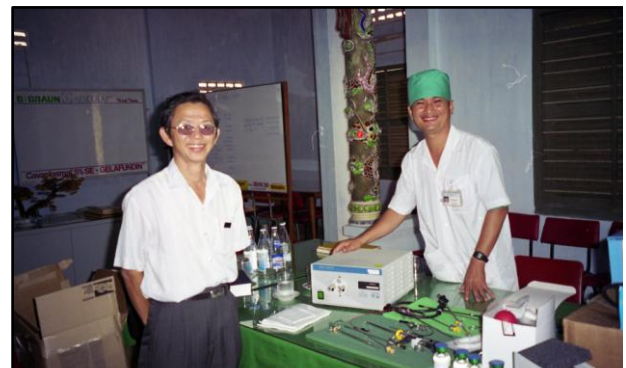
Donation of first urological instruments to Nha Trang province hospital, 2000