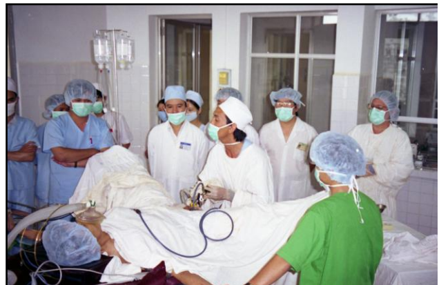
First operation of prostate ever done in Buon Ma Thuot