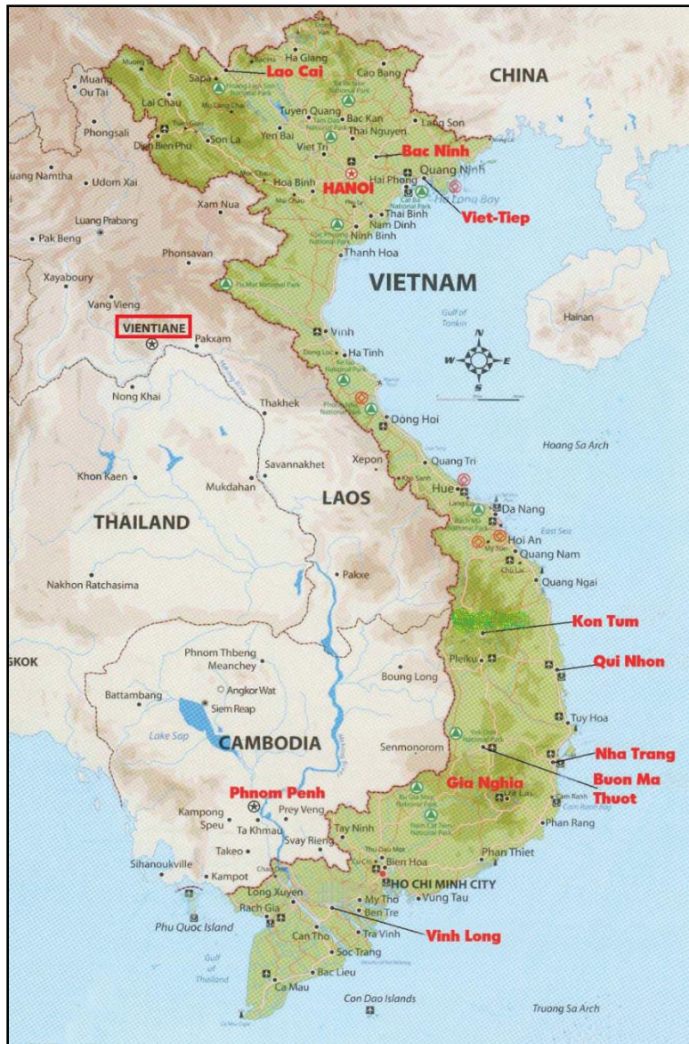
Global Medical Volunteer have established programs in cities highlighted in red