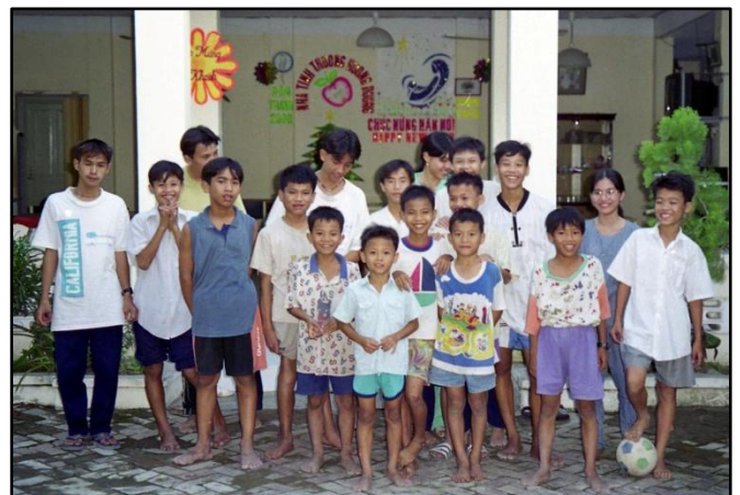
Catholic orphanage in Nha Trang for children four to eighteen years of age