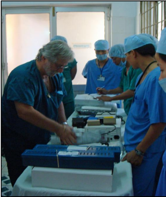
Donation of surgical equipment to Vinh Long province hospital

GMV has donated medical equipment to 6 Vietnamese Province Hospitals plus 2 hospitals in Cambodia and Laos. These hospitals extend from the Mekong Delta in the south to the Chinese border in the north. We instructed the surgeons in these hospitals on the use of the equipment plus advanced surgical techniques.