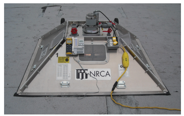
An example of a test chamber used for negative-pressure uplift testing

There are two recognized field test methods for determining adhered membrane roof systems' uplift resistances: ASTM E907, "Standard Test Method for Field Testing Uplift Resistance of Adhered Membrane Roofing Systems," and FM Global Loss Prevention Data Sheet 1-52 (FM 1-52), "Field Verification of Roof Wind Uplift Resistance."