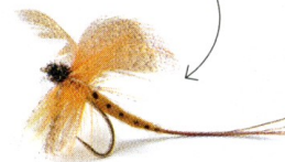
FLY-FISH LIKE BRAD PITT