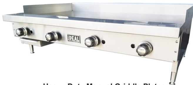
Heavy Duty Manual Griddle Plates