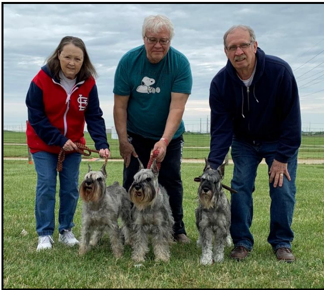
Family pic - this is where it all started. L-R GCHB CH Cedar Hills Enchanted Yellow Rose. "Ellie", CH Von Rose Enchanted Christmas Vision "Ivy", daughter Von Rose Out of the Mist "Isa".

Peppermil Rocking the Naughty List "Coal" was winners dog for 3 point major on Sunday and another 3 point major on Monday