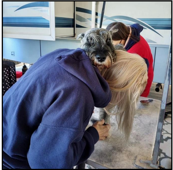
GCHG CH von Rose Masked Phantom "Phantom" says "ho hum here we go again".