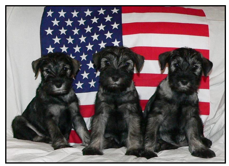
Happy 4<sup>th</sup> of July !!