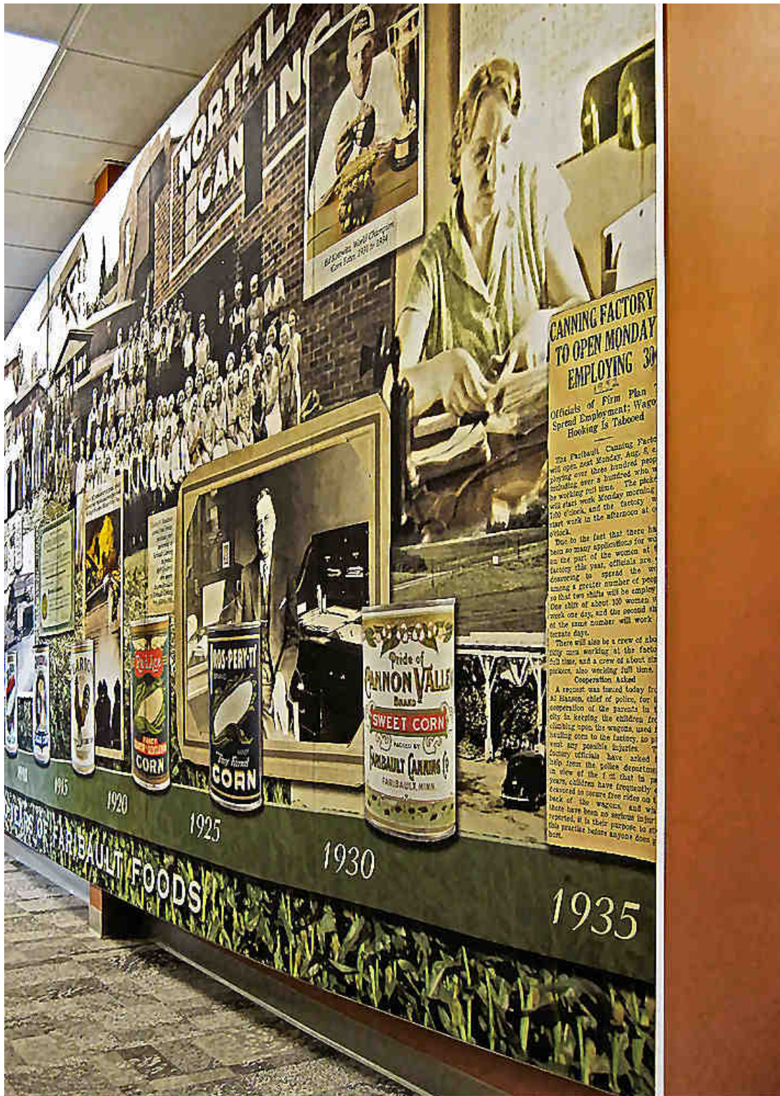
The finished result was stunningly beautiful and the client was extremely pleased.