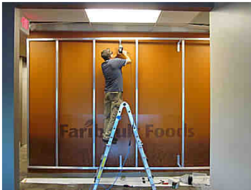
Frame installation - The TS32 frame is installed on "L" brackets