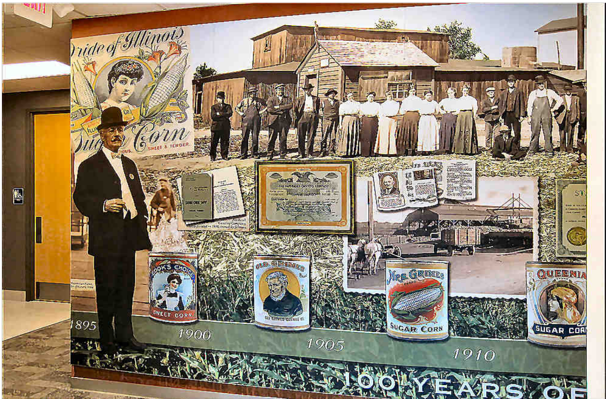
287" Wide by 107" High TS32 Frame with Graphic Wrapped Around the Frame The graphic is wrapped around the frame and fixed in the back of the frame.