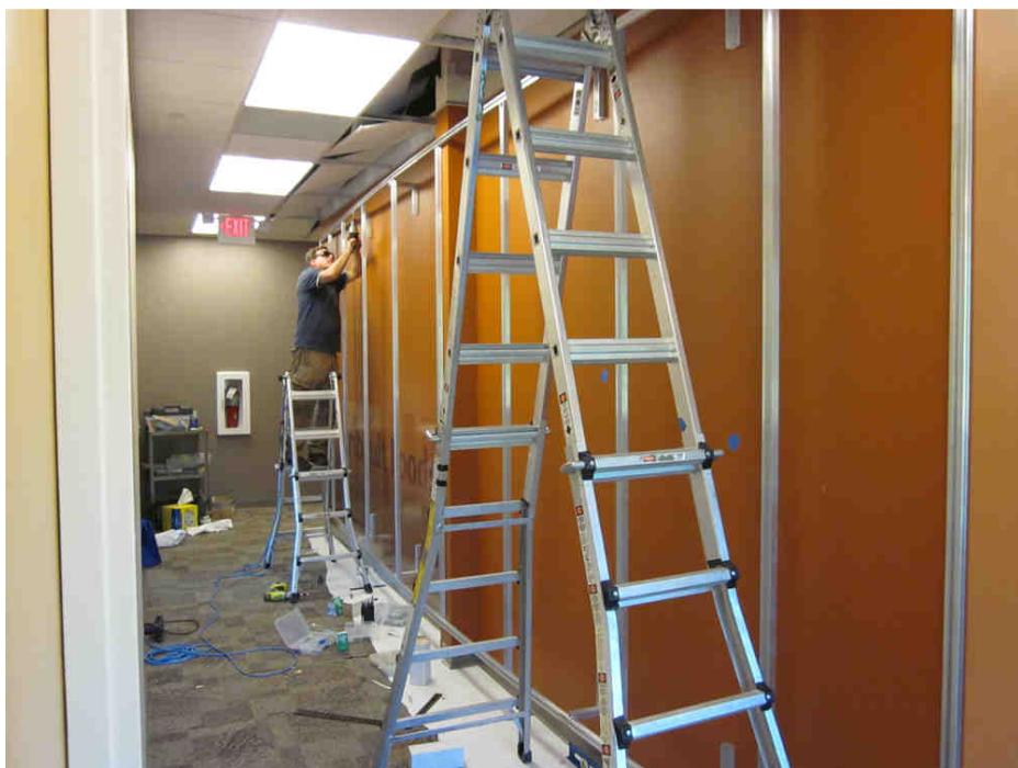
Another view of the 287" wide x 107" high TS32 frame. The graphic will be fixed and stretched on the side of the frame.