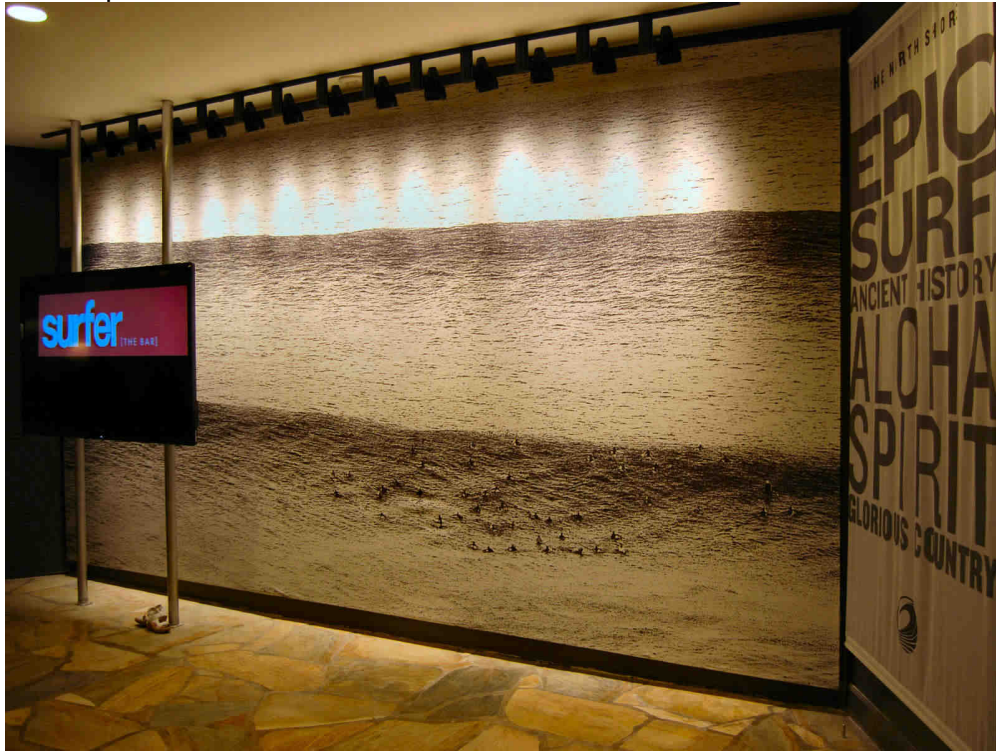
This kind of frame installation is perfectly suited for corporate lobbies, museums, exhibitions hallways, Board Rooms, etc...

Another spectacular result for this framed fabric installed in a new resort in Hawaii.