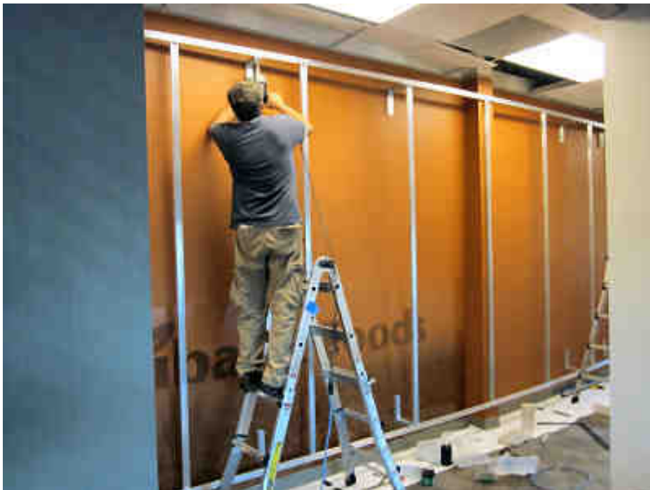
The TS32 extrusions were bent in a machine shop to go around the pillar in the middle of the hallway.