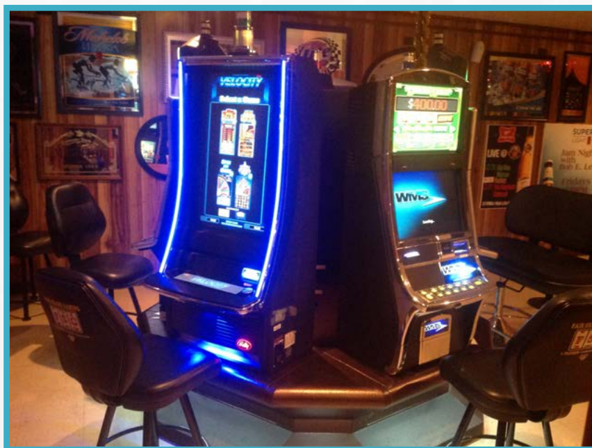
Unique carousel design in J Martin's Tap, Steger, IL