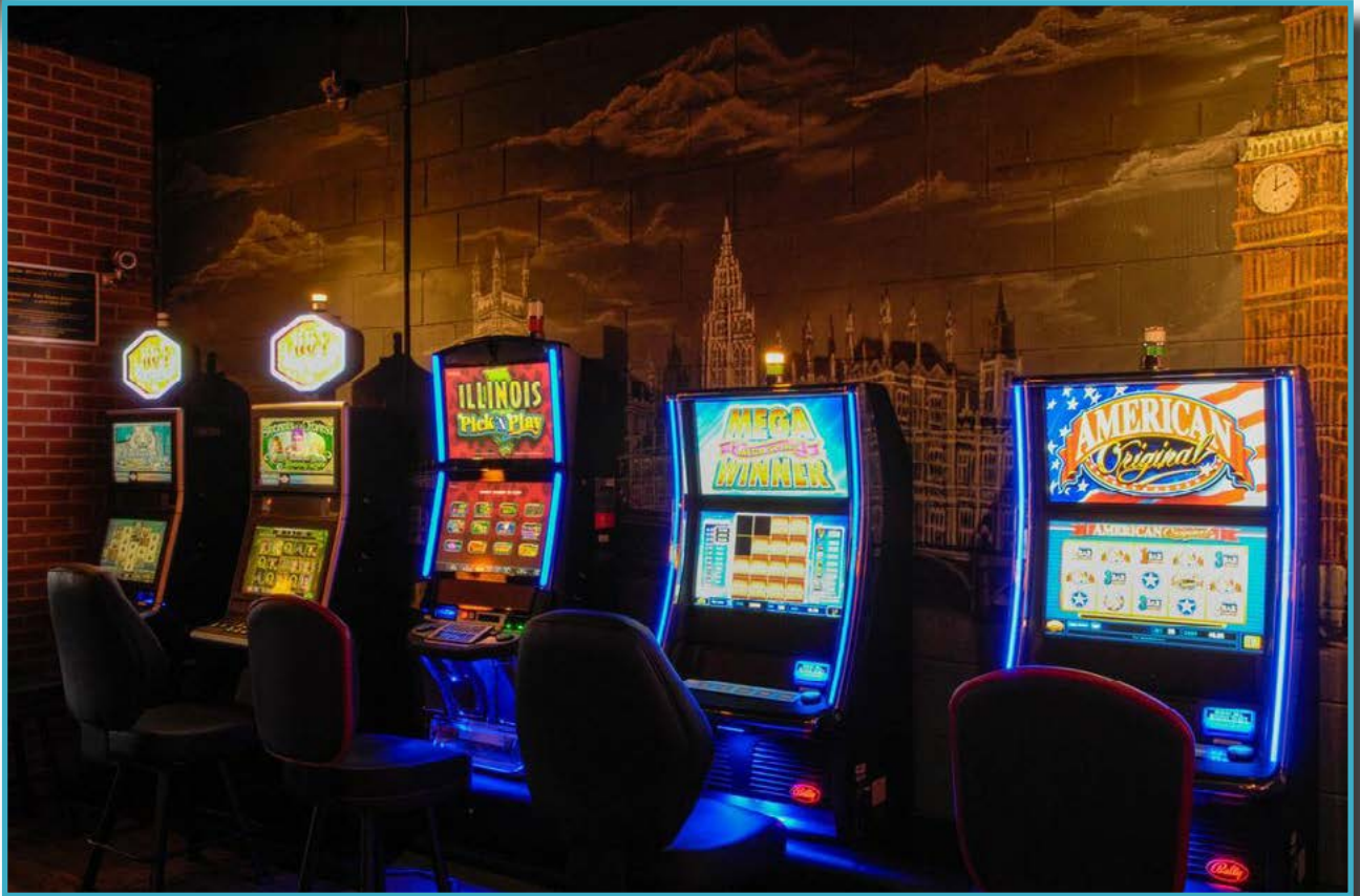
Duett Bar in Justice

Customers note and comment on the great mix of our machines and variety of gaming options compared to other operators who install all the same machines and games. Besides the quick response to any problems, which are rare, their staff is competent and professional. Their willingness to provide input and be open to suggestions has been great. Besides the gaming, we use their bar-top games, dart, golf games, pinball machines, and a top of the line Jukebox system, which makes it a little bit easier to know who to call when an issue does occur. Keep up the great work! Completely satisfied.