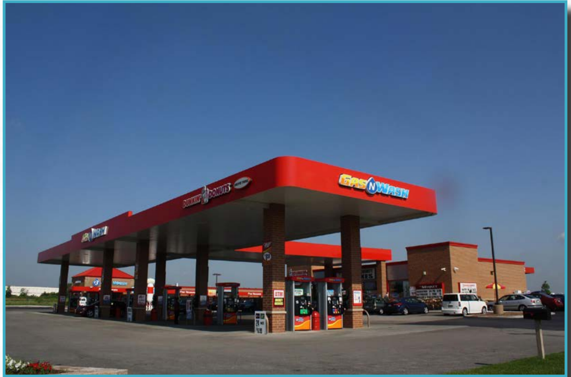
Lenny's Gas N Wash, Mokena, IL

In July of 2009, the state of Illinois passed legislation legalizing the use of video gaming terminals in alcohol pouring establishments, fraternal establishments, veteran establishments, as well as qualified truck stops.